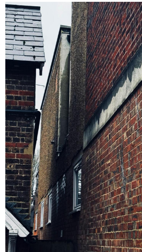
Existing rendered wall facing adjacent building