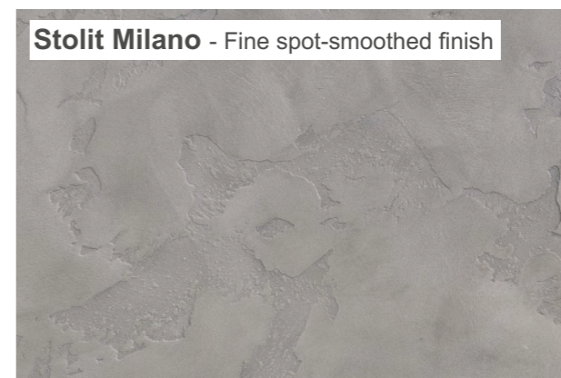
Stolit Milano - Fine spot-smoothed finish