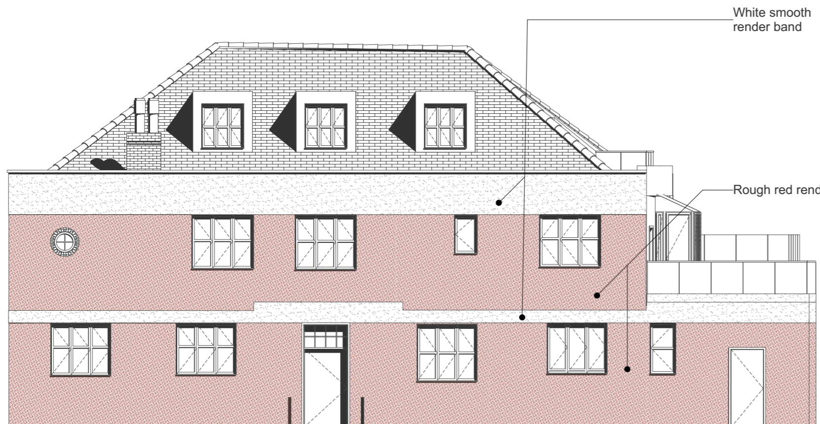
PROPOSED North West Elevation