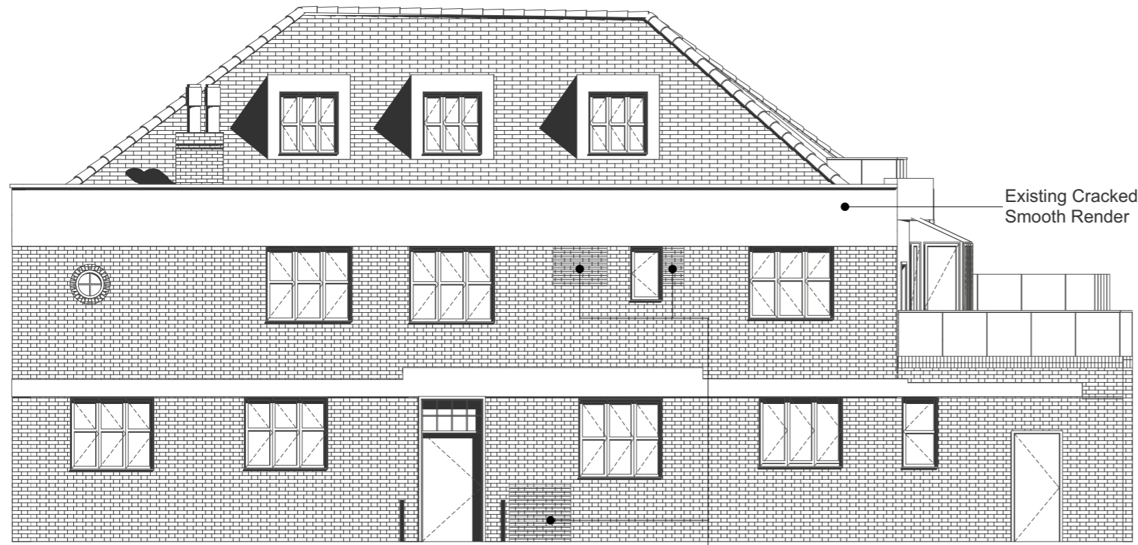
EXISTING North West Elevation