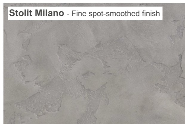
Stolit Milano - Fine spot-smoothed finish