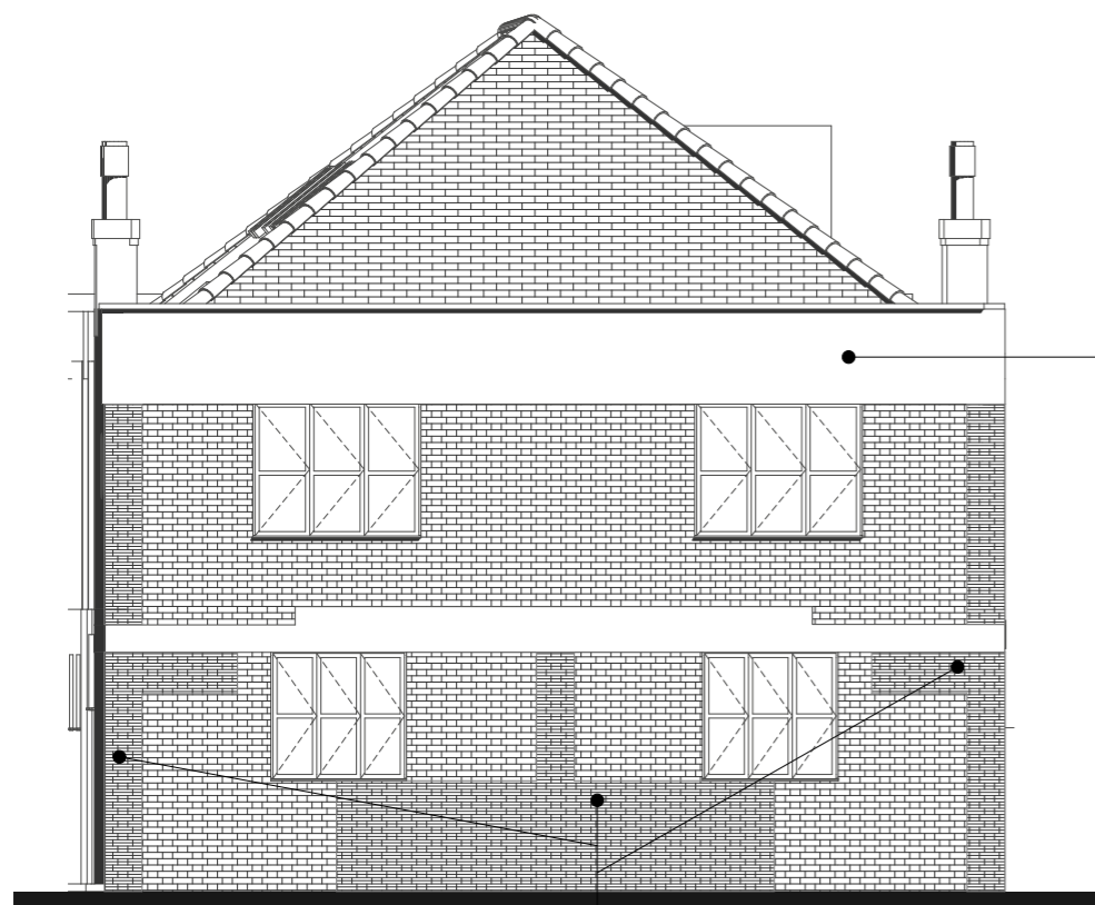
EXISTING North East Elevation