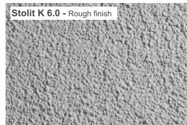
Stolit K 6.0 - Rough finish