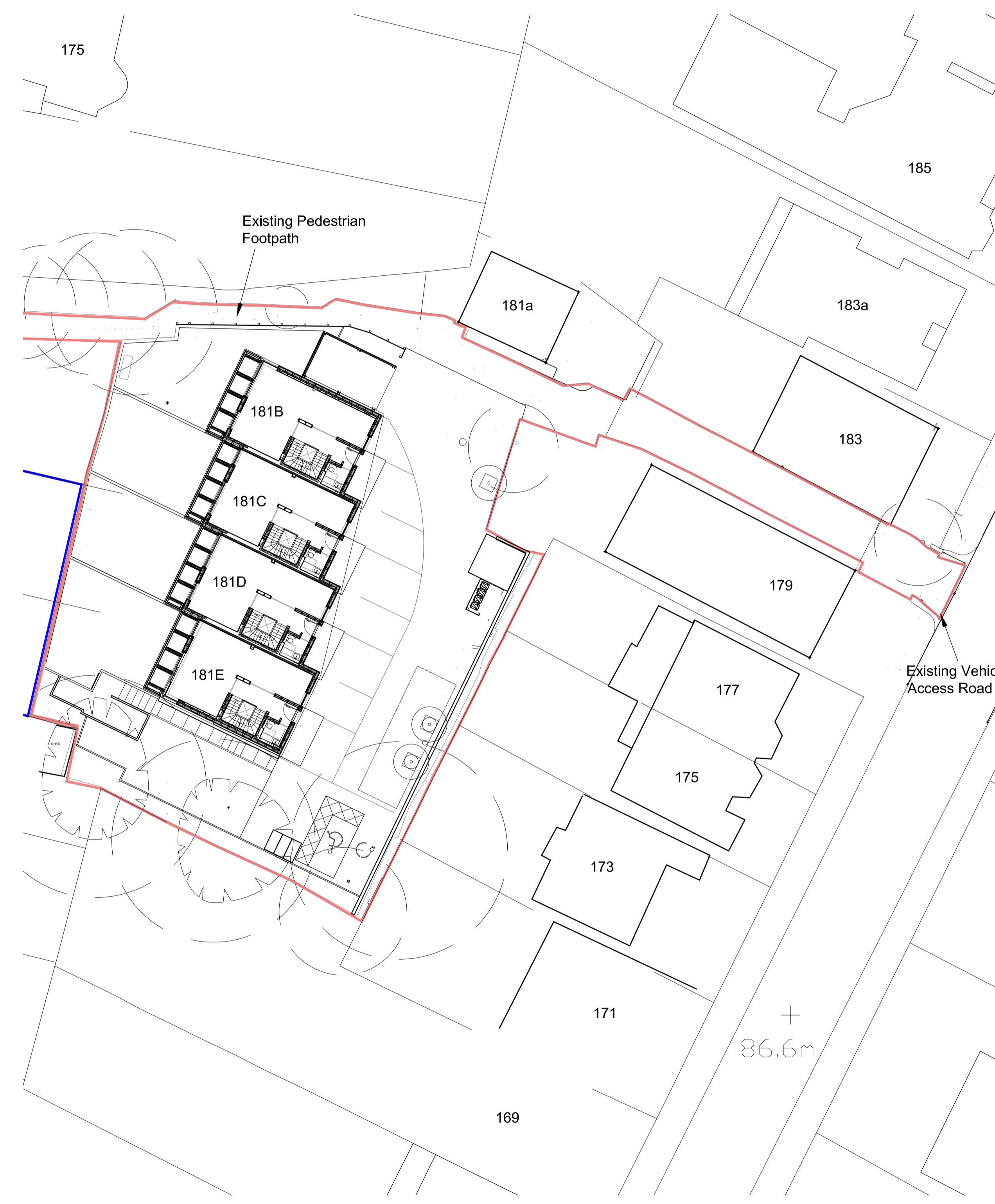
2 Proposed Site Block Plan SCALE 1:500@A3