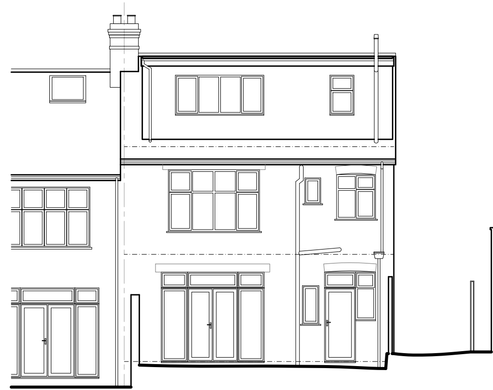
Rear Elevation As Existing 1:100