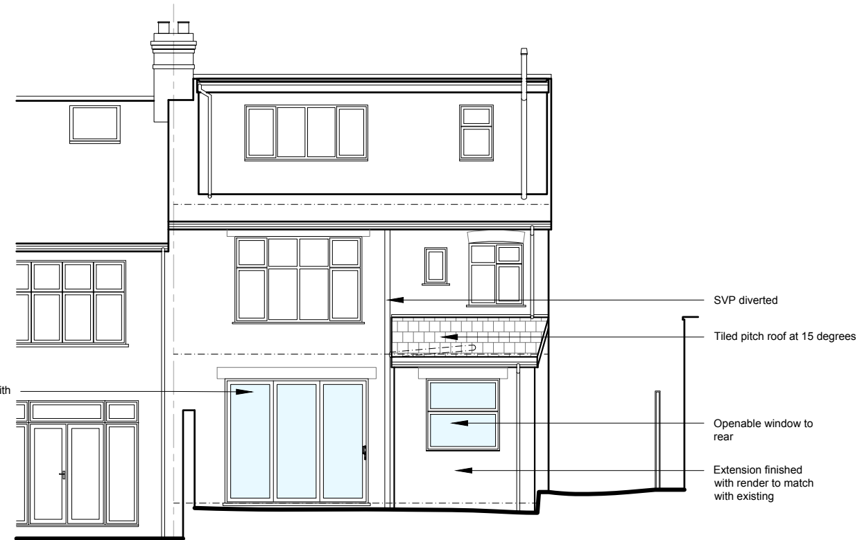
Rear Elevation As Proposed 1:100