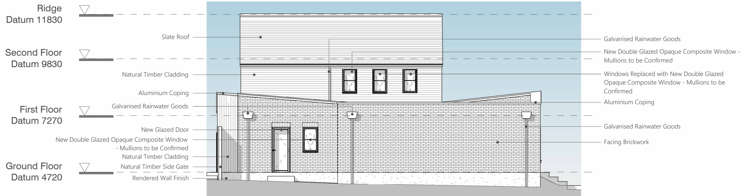
4. Proposed North Elevation scale 1 : 100

THIS IS A COLOURED DRAWING If this box does not appear Red, the drawing may not be represented properly