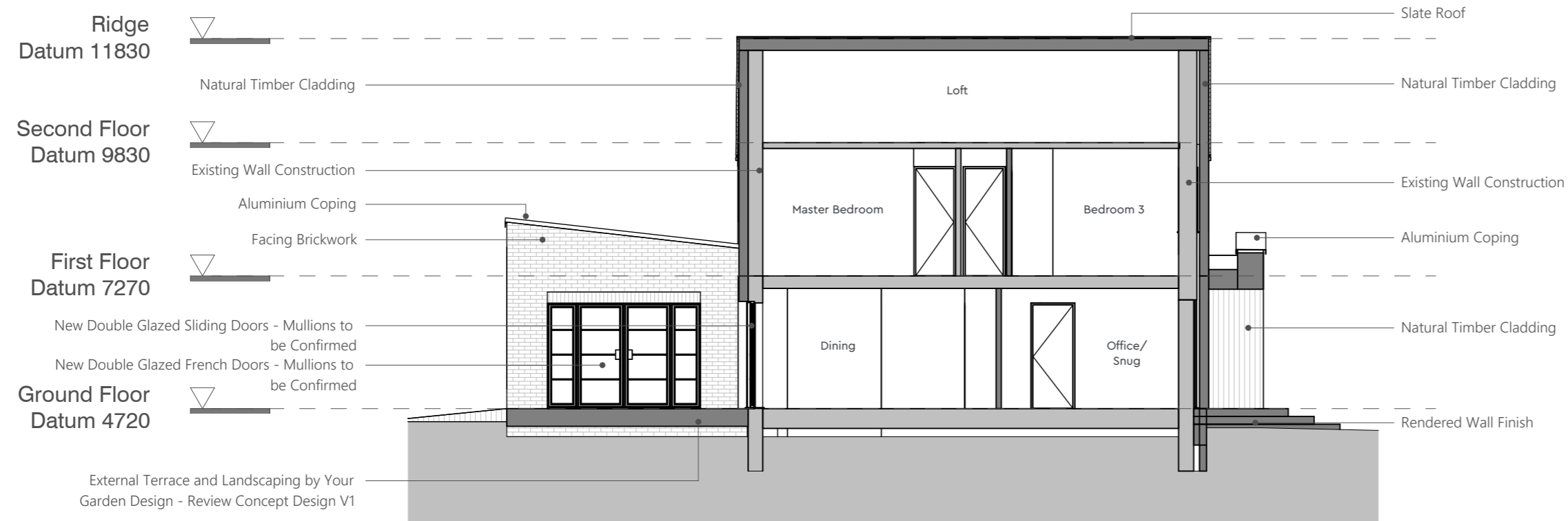
2. Planning Section BB scale 1 : 100

THIS IS A COLOURED DRAWING If this box does not appear Red, the drawing may not be represented properly