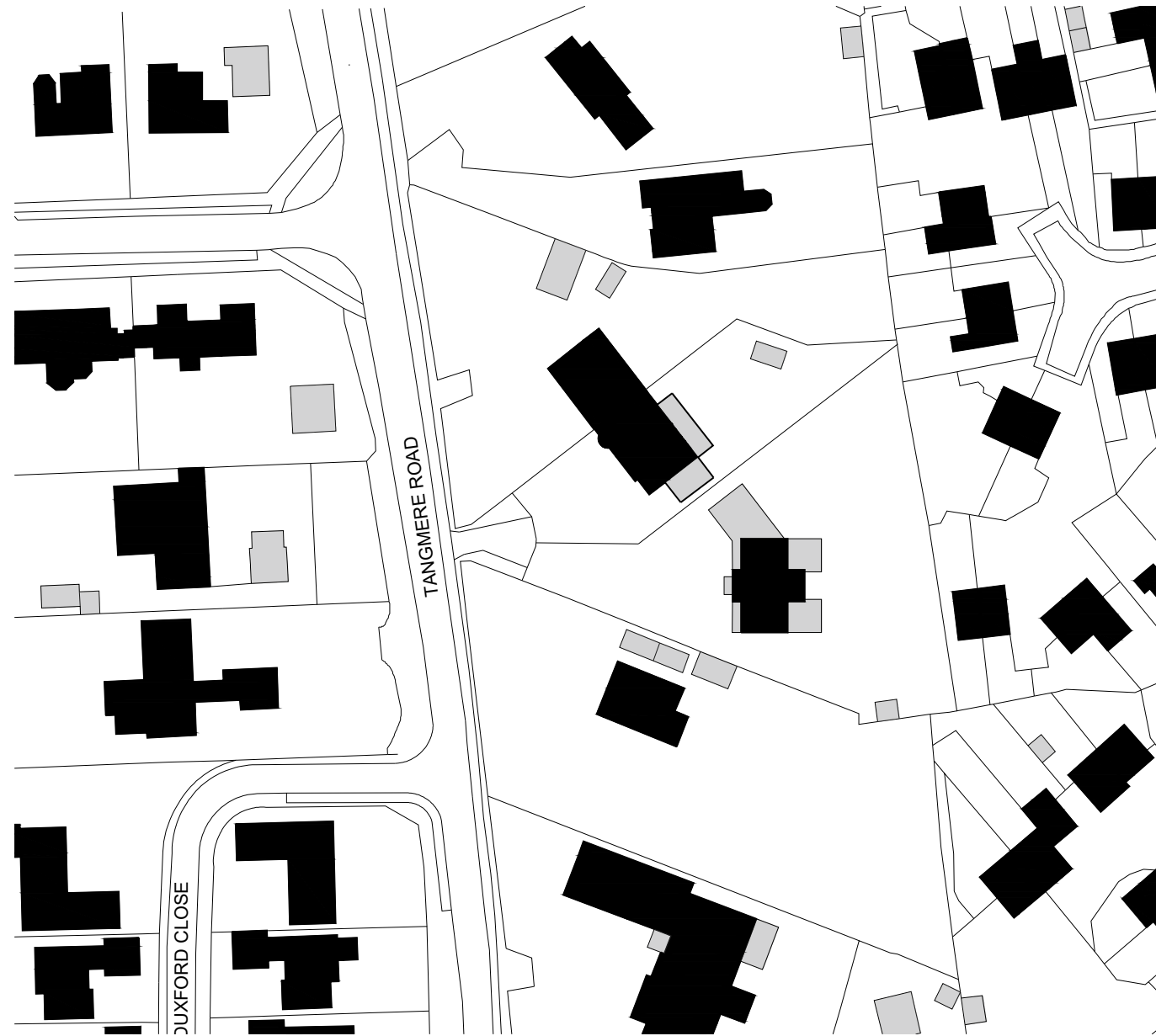
Proposed Context Plan Scale 1:1000@A3