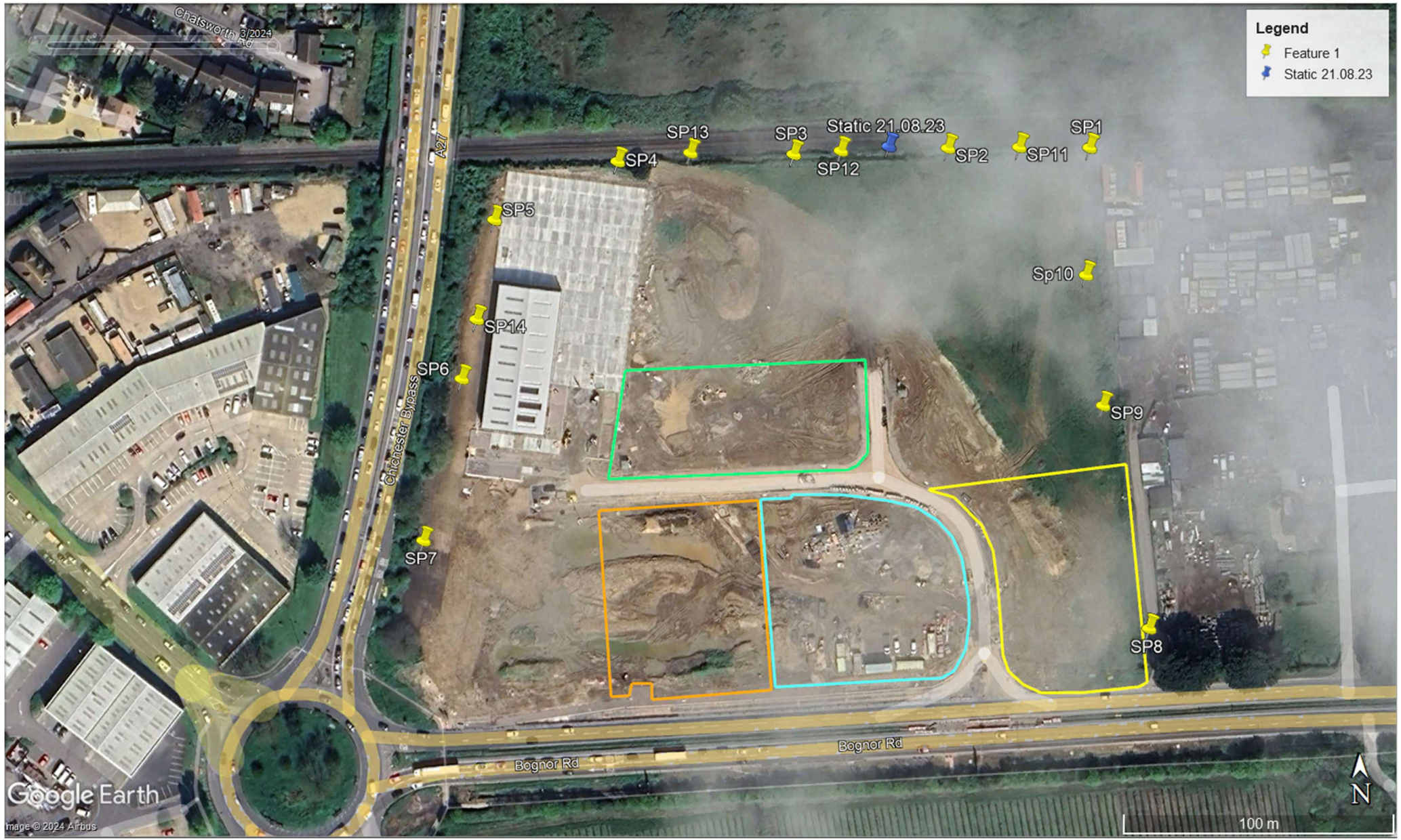
11.0 Figure No. 01 - Bat Activity Survey Points