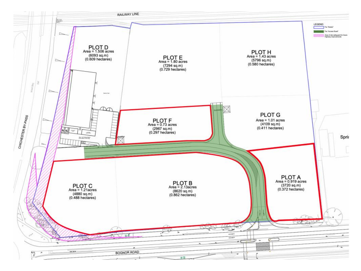
Fig 1: Final reserved matters application plots

2.3 The next section of this report outlines the construction works completed thus far, and provides information on the site-wide infrastructure installed to facilitate the development of future plots.