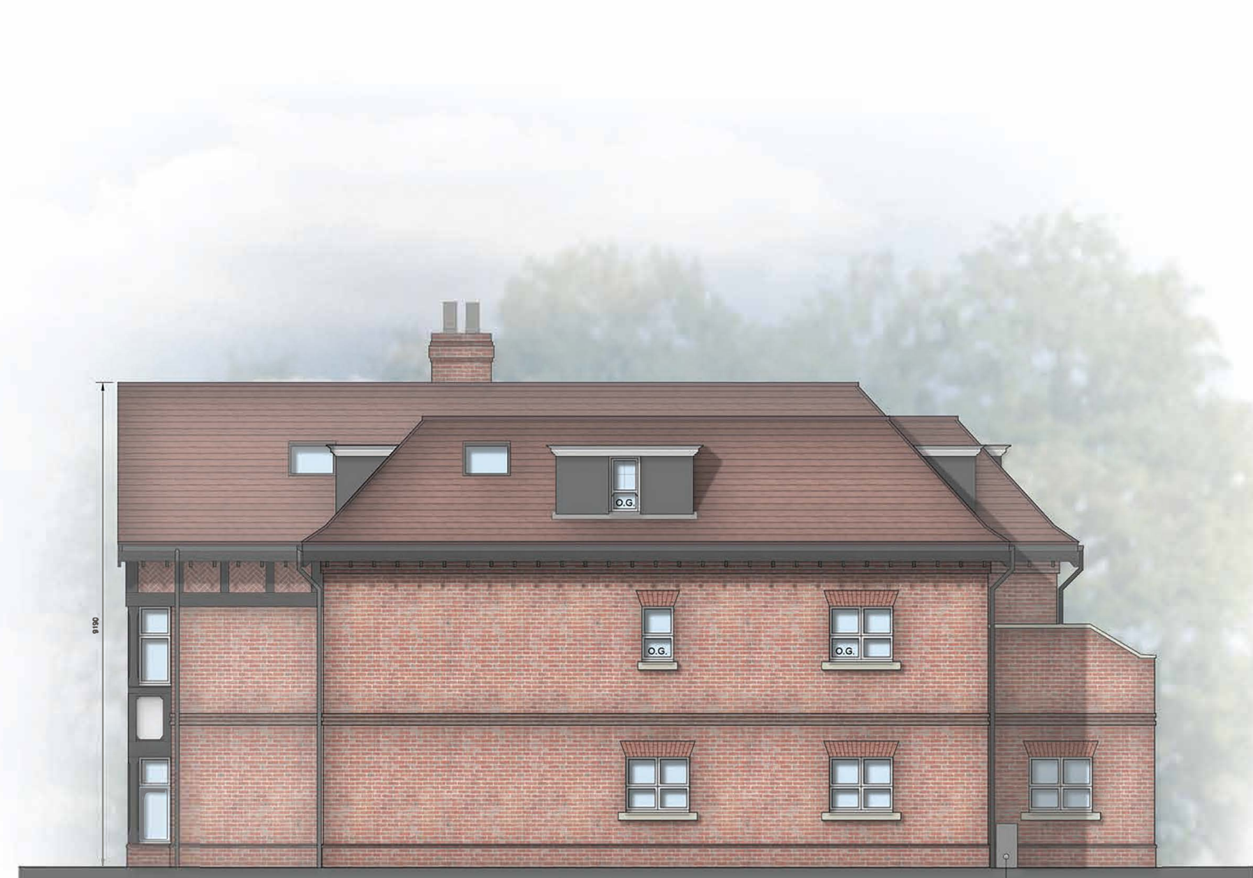
Side Elevation (North)