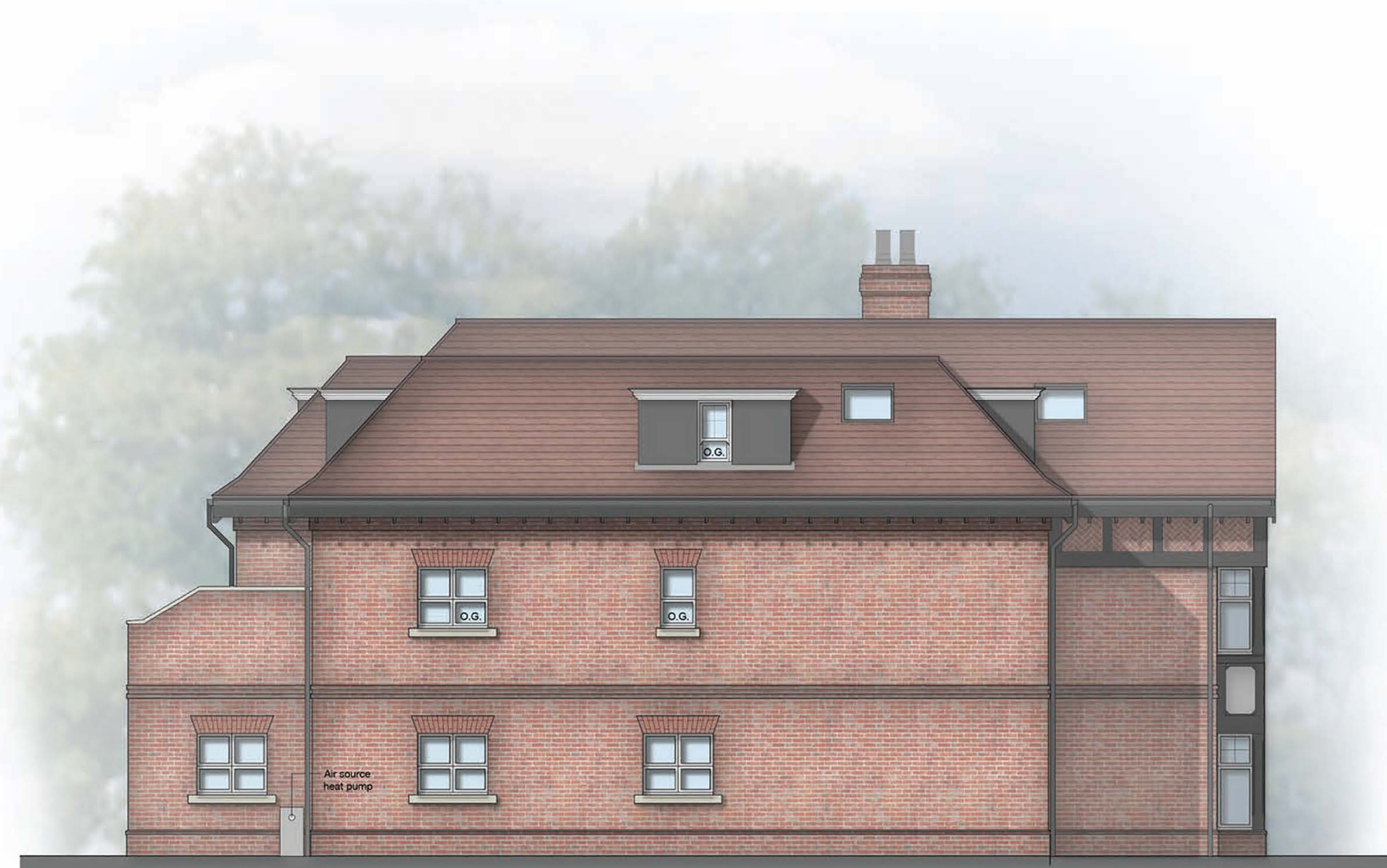
Side Elevation (South)