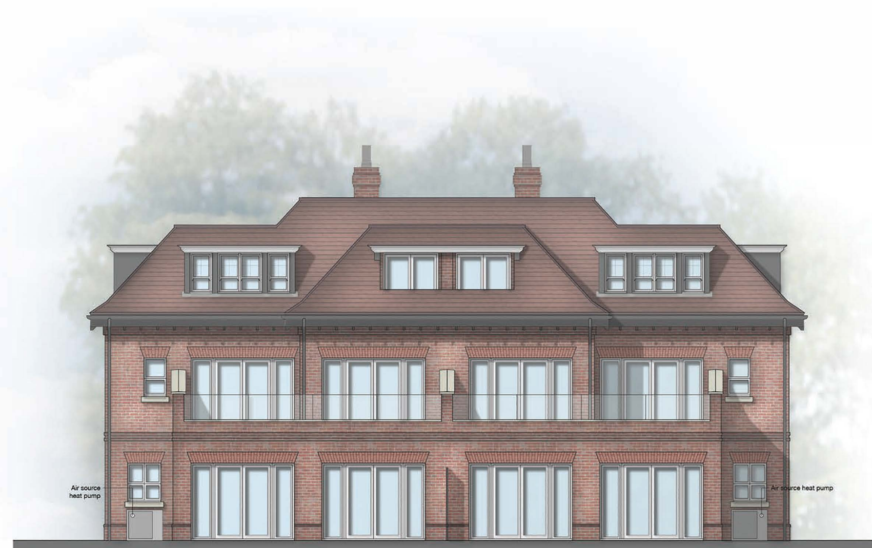
Rear Elevation (West)