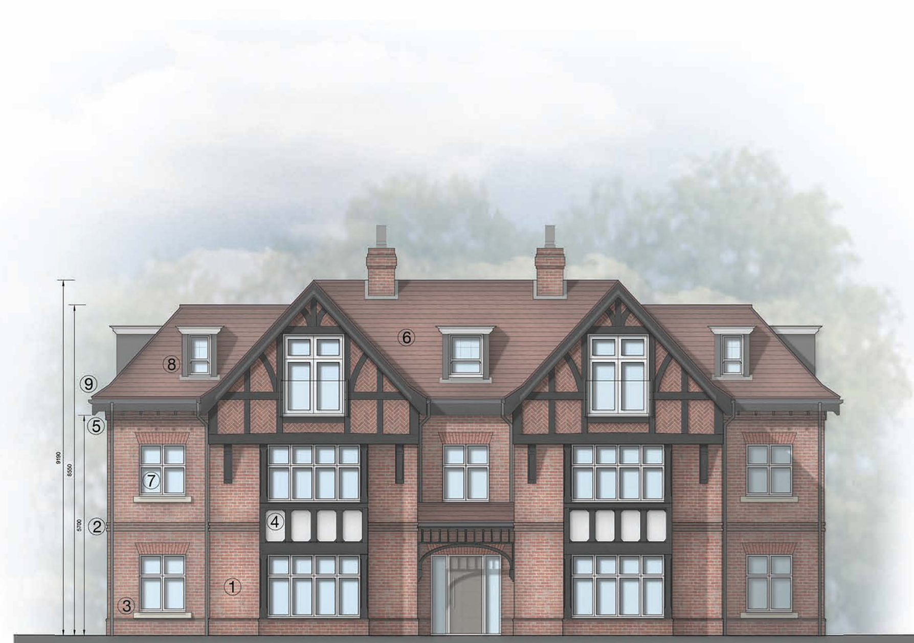
Front Elevation (East) 3 Lavant Road