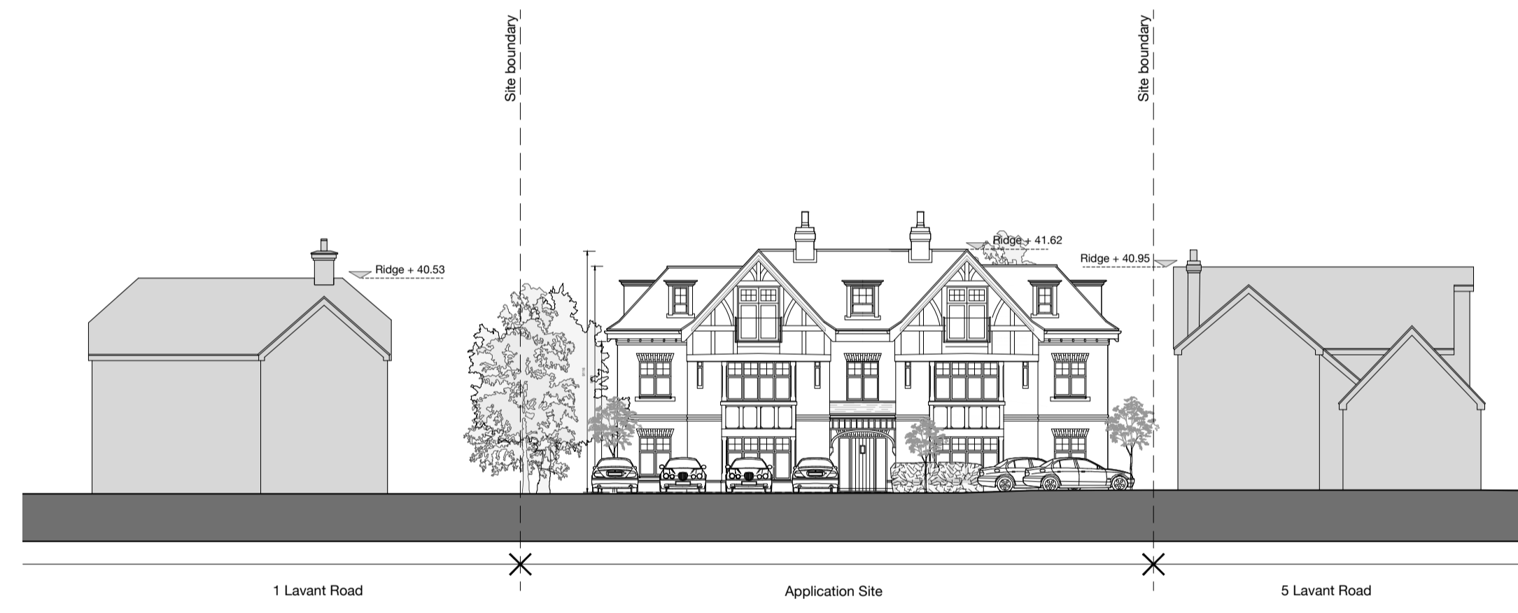
Site Section B-B