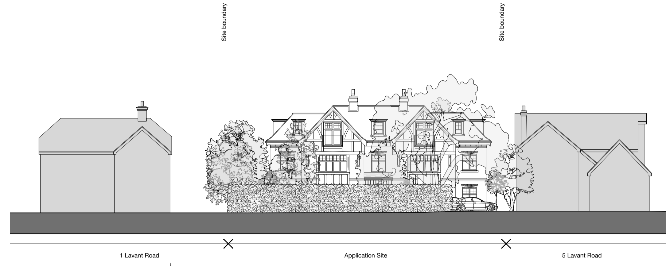
Street Scene / Site Section A-A