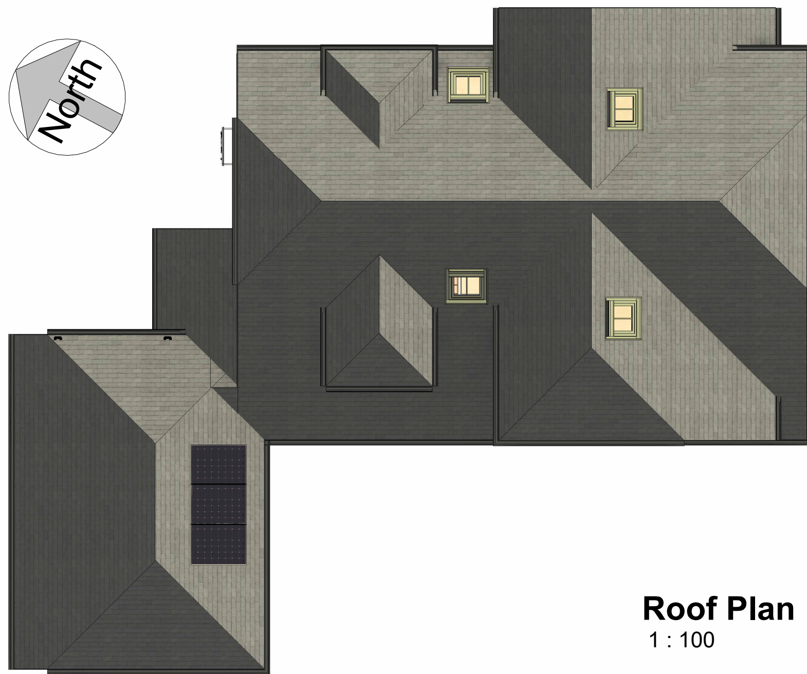
Roof Plan 1 : 100