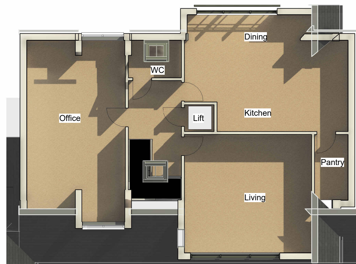
First Floor 1 : 100