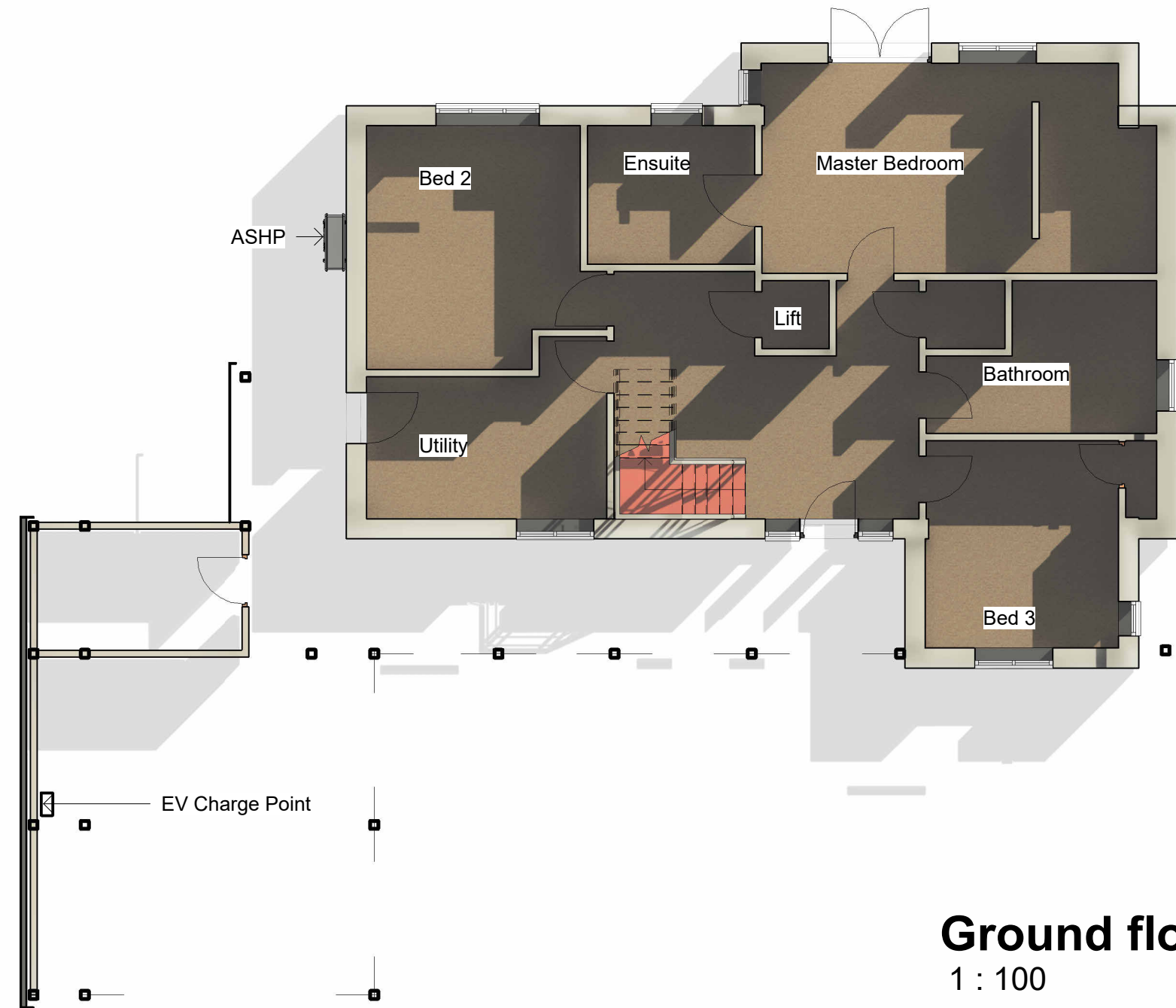
Ground floor 1 : 100