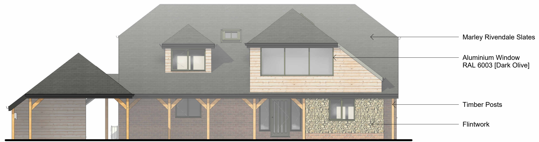
West Elevation 1 : 100