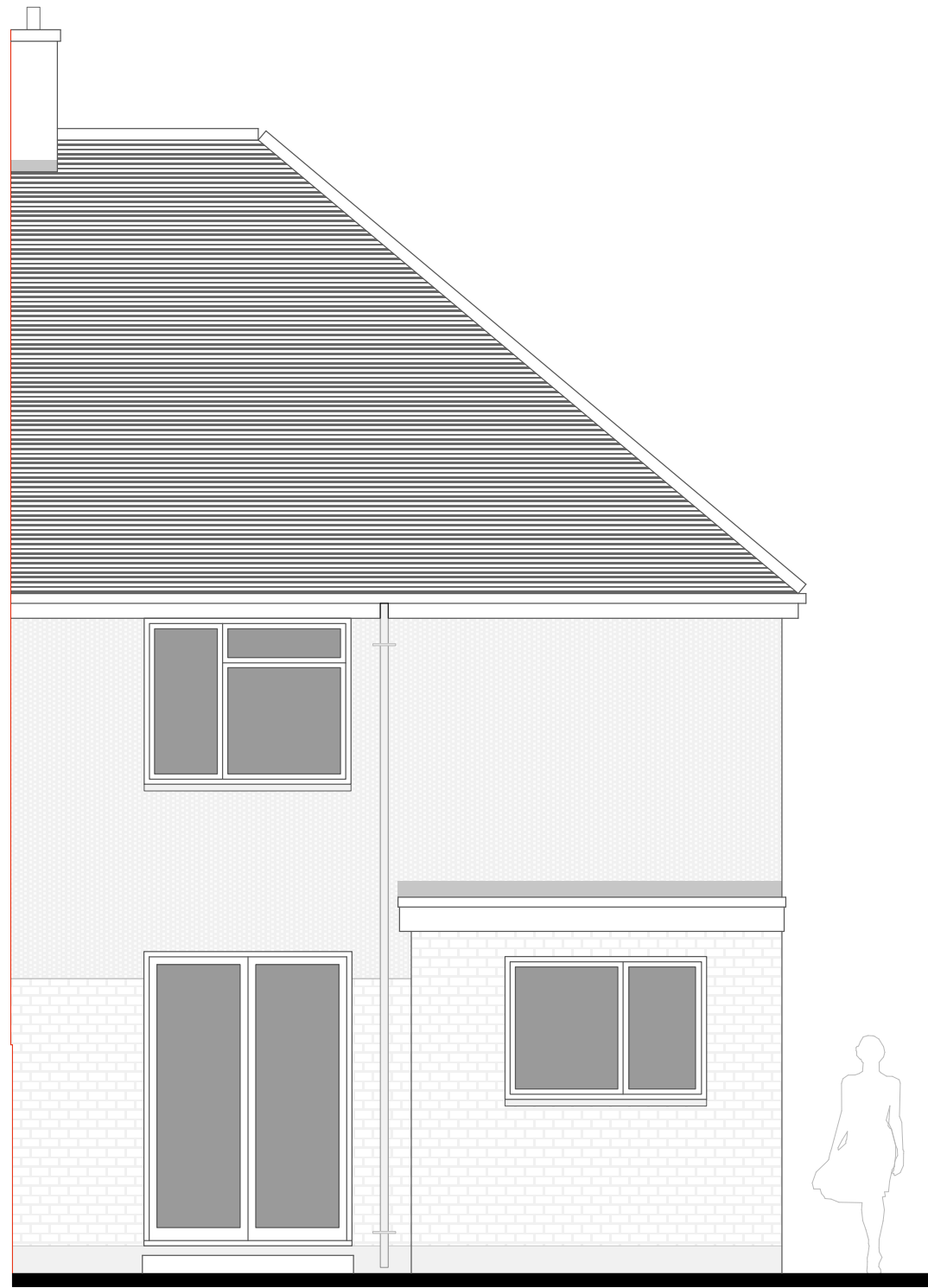
Existing Rear Elevation at 1:50 scale SOUTH EAST