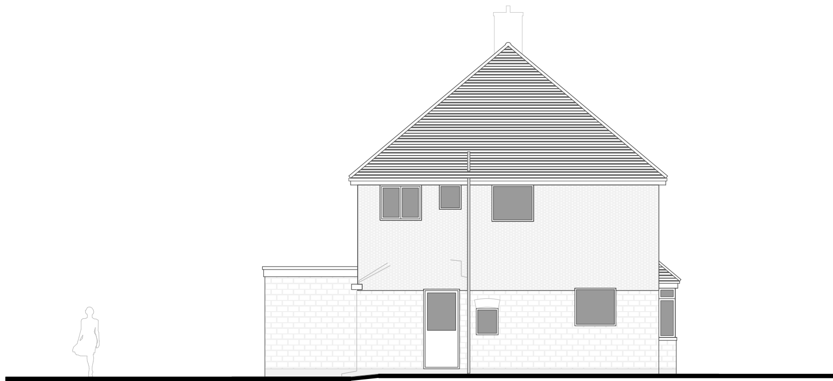
Existing Side Elevation at 1:50 scale NORTH EAST