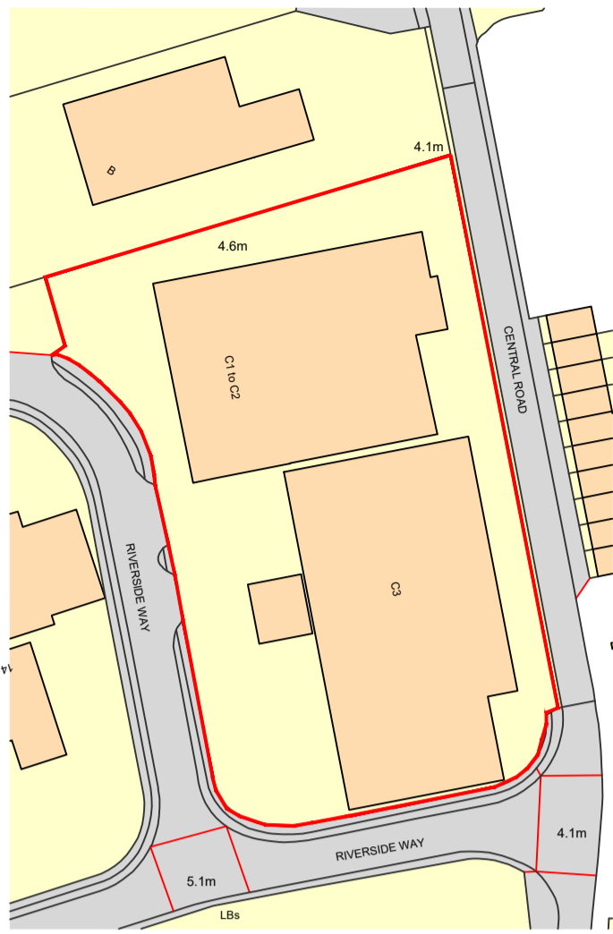
01 Existing Block Plan