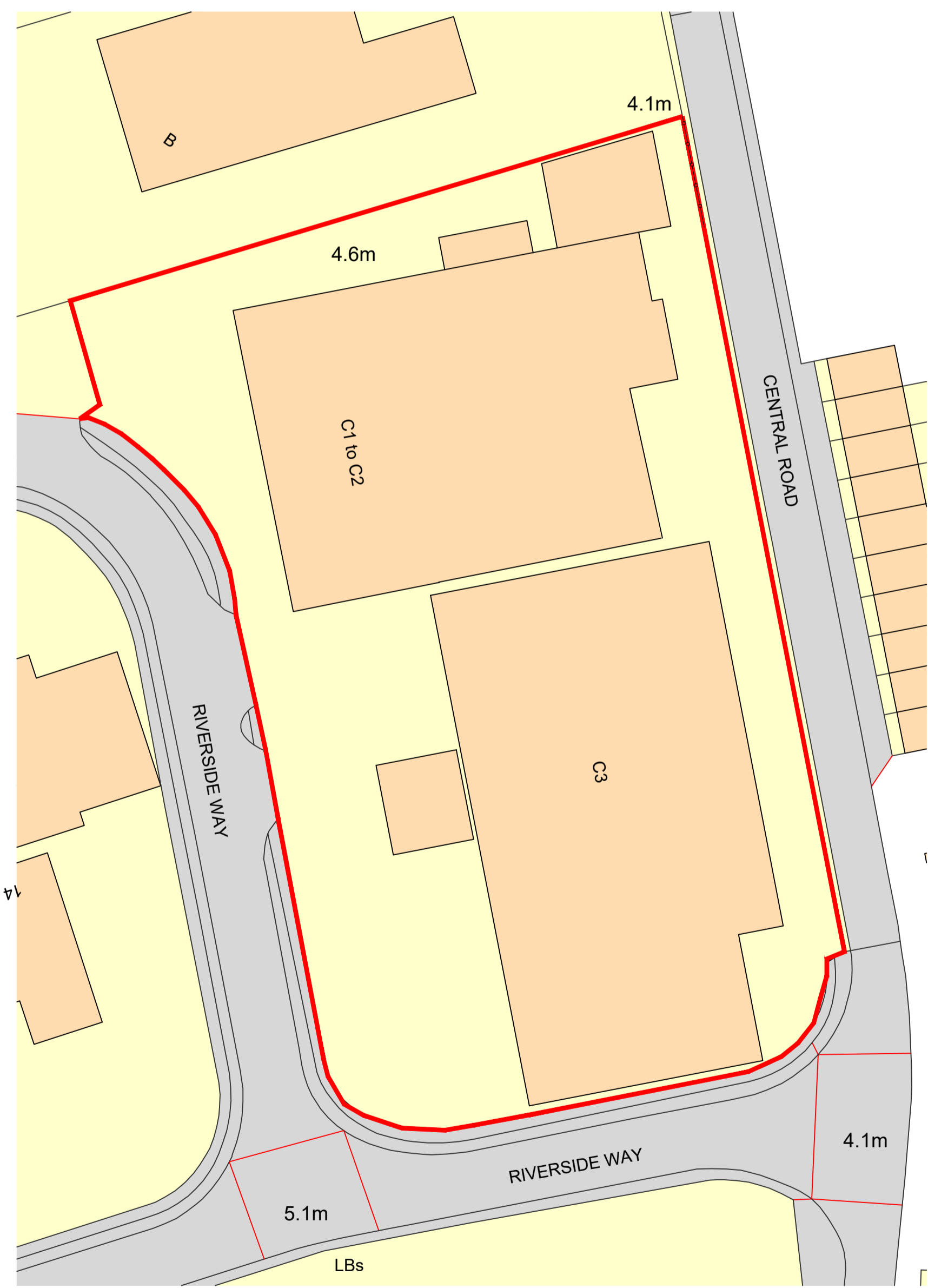
02 Proposed Site Plan