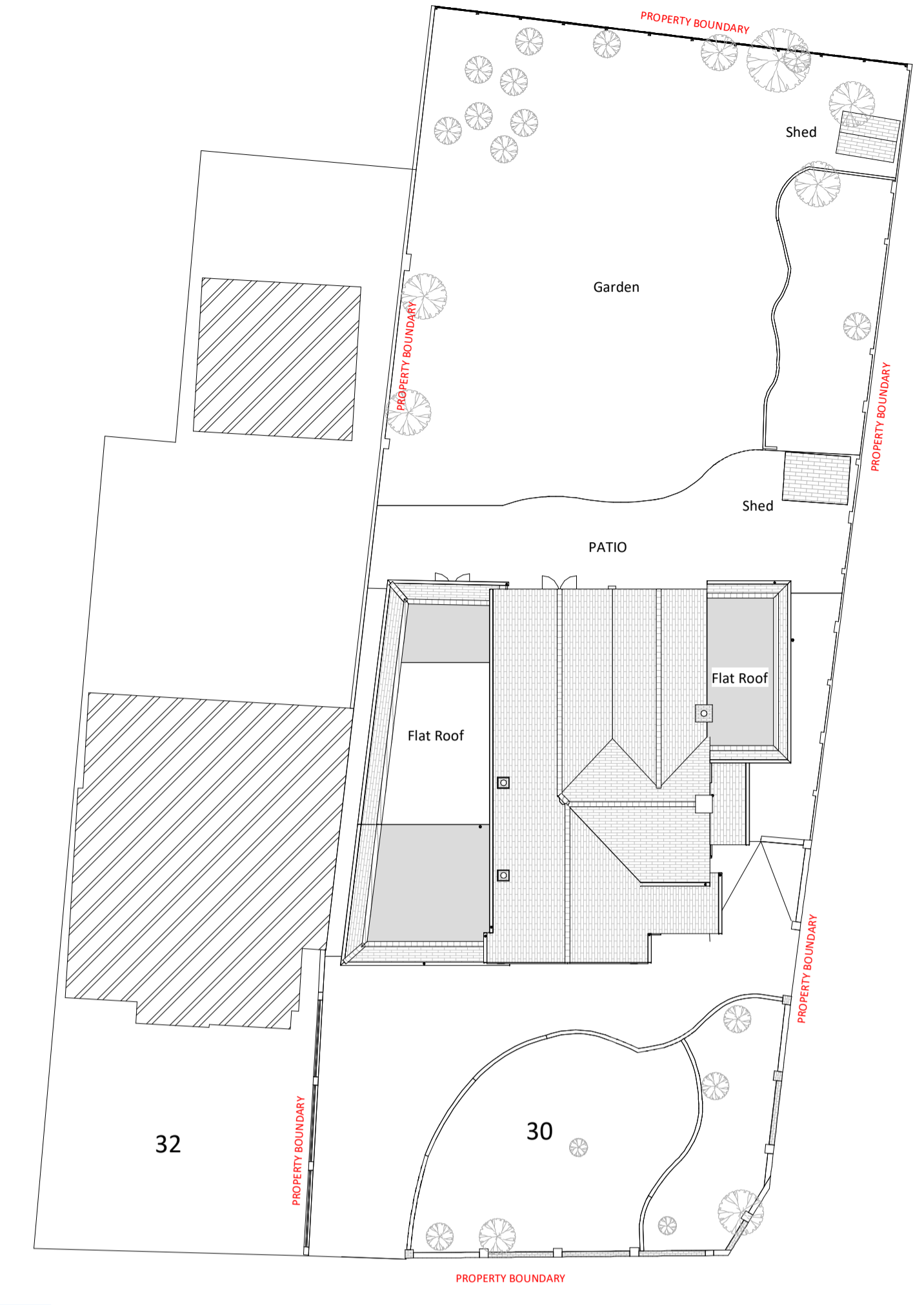
3 Site 1 : 200