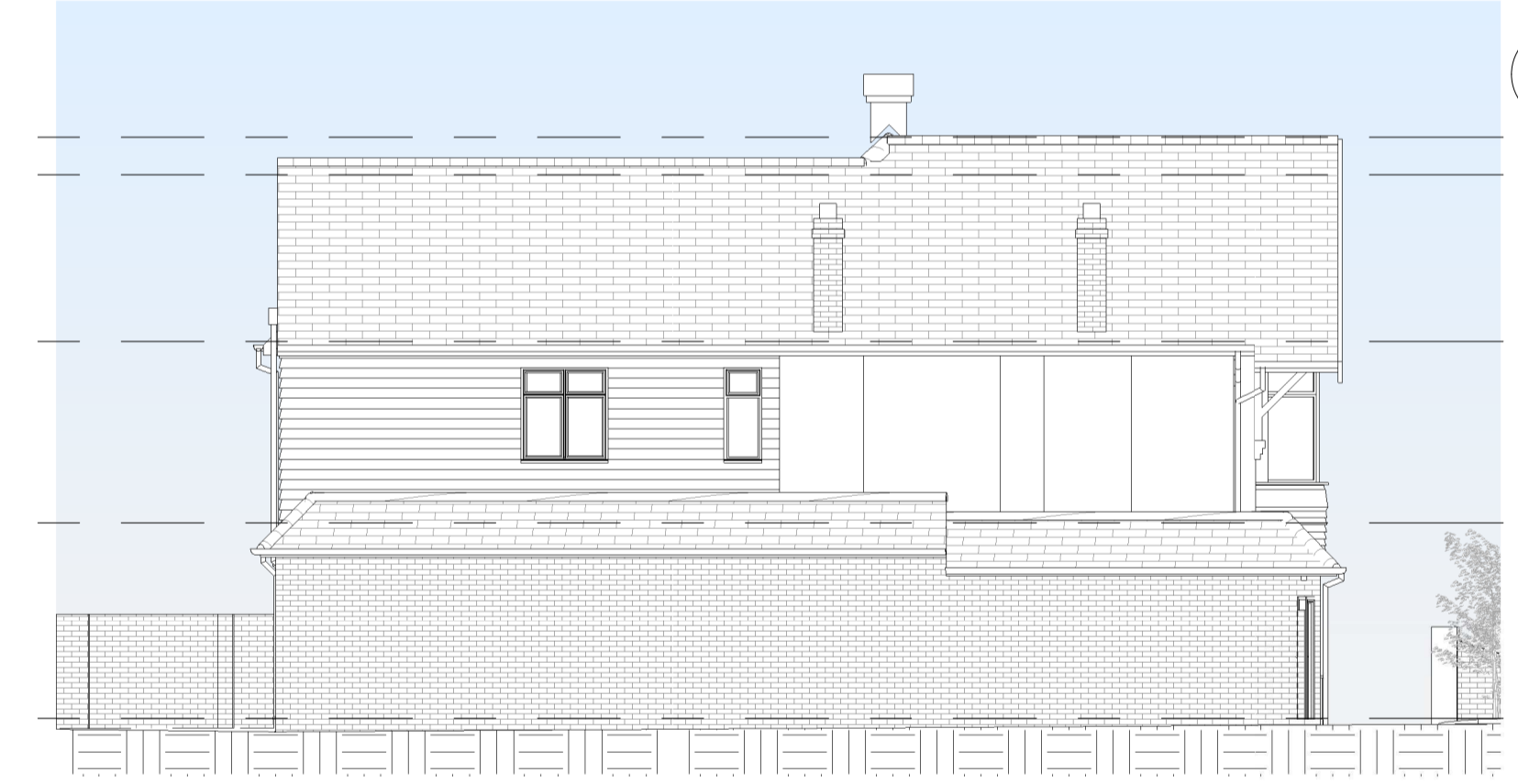
6 Existing Left Elevation 1 : 100