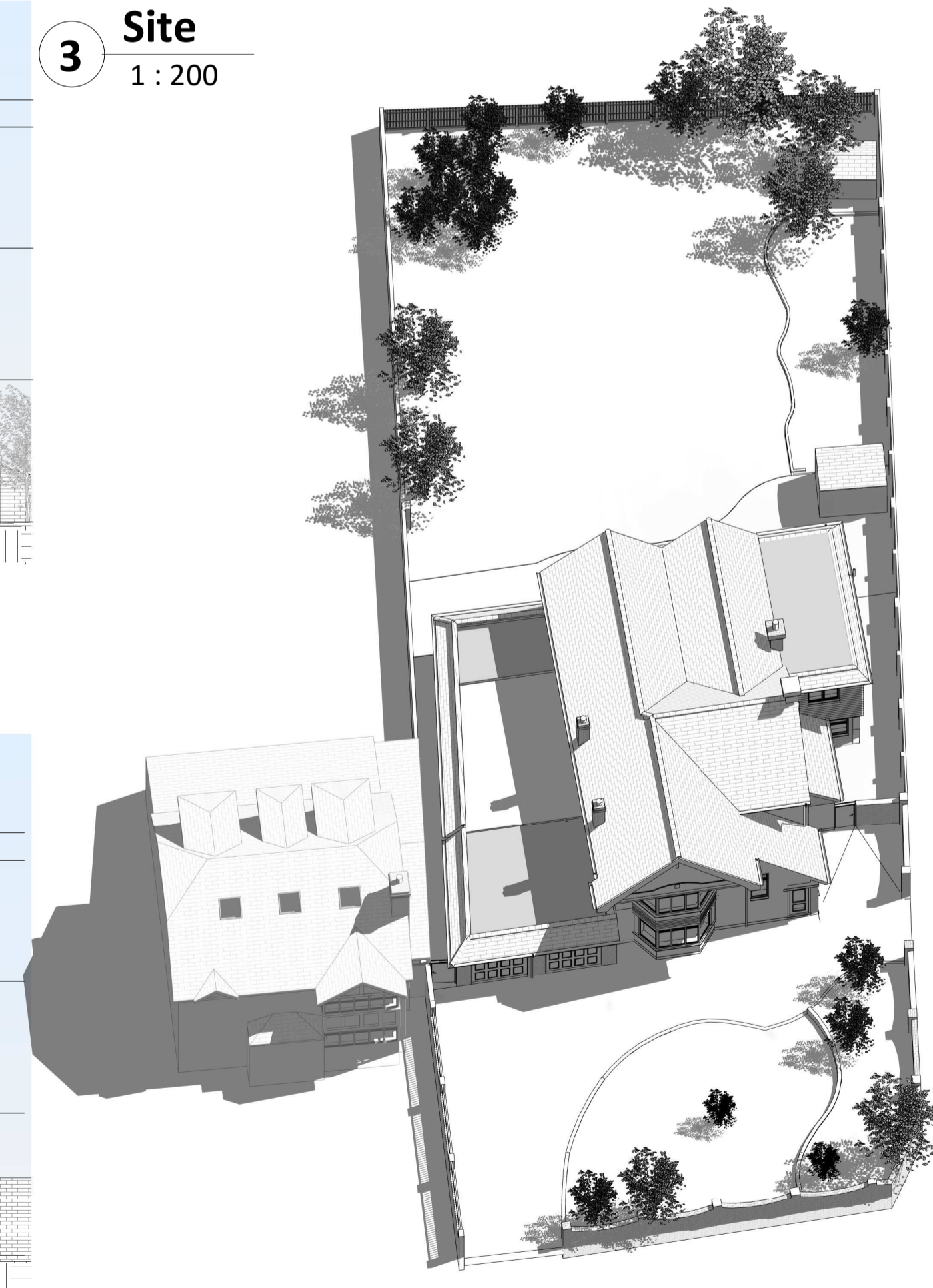
8 Existing 3D Front

© This drawing is the property of Bluetime Retail Ltd who retain the sole copyright of its contents & it may not be reproduced in part or in whole without written permission