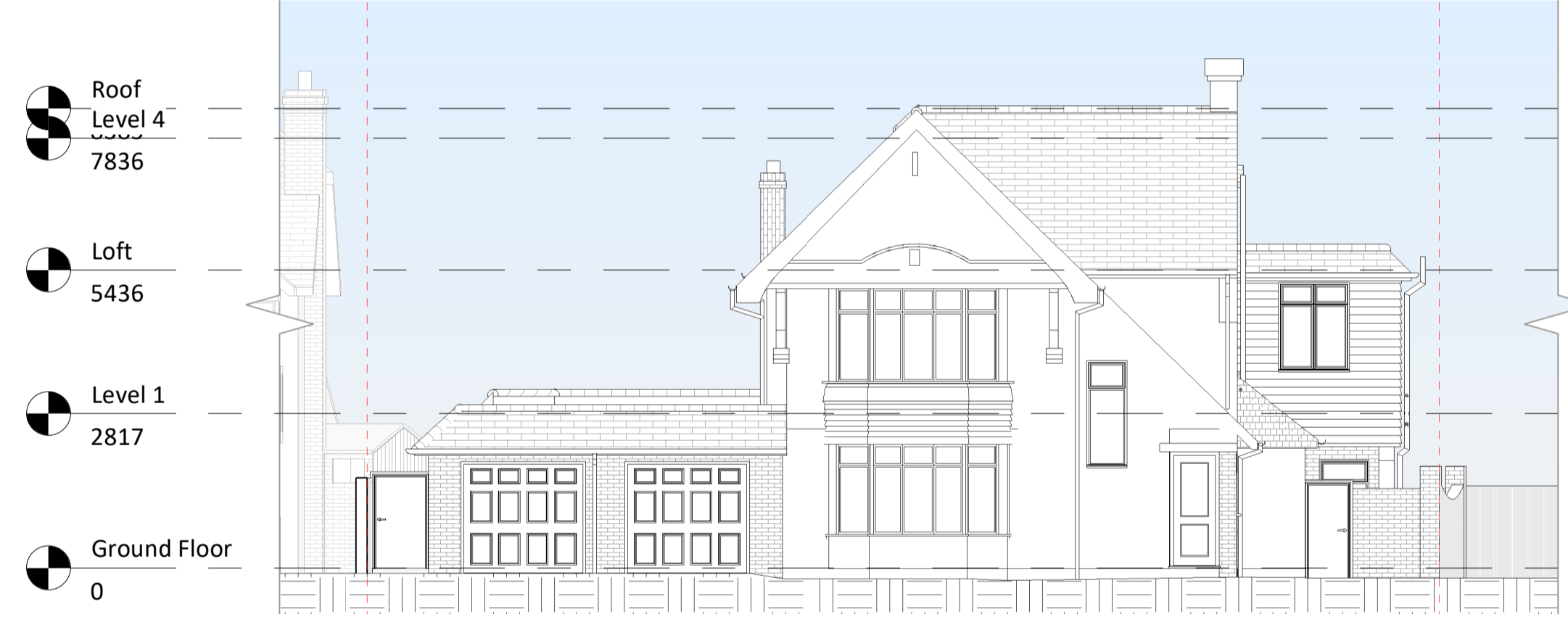
4 Existing Front Elevation 1 : 100