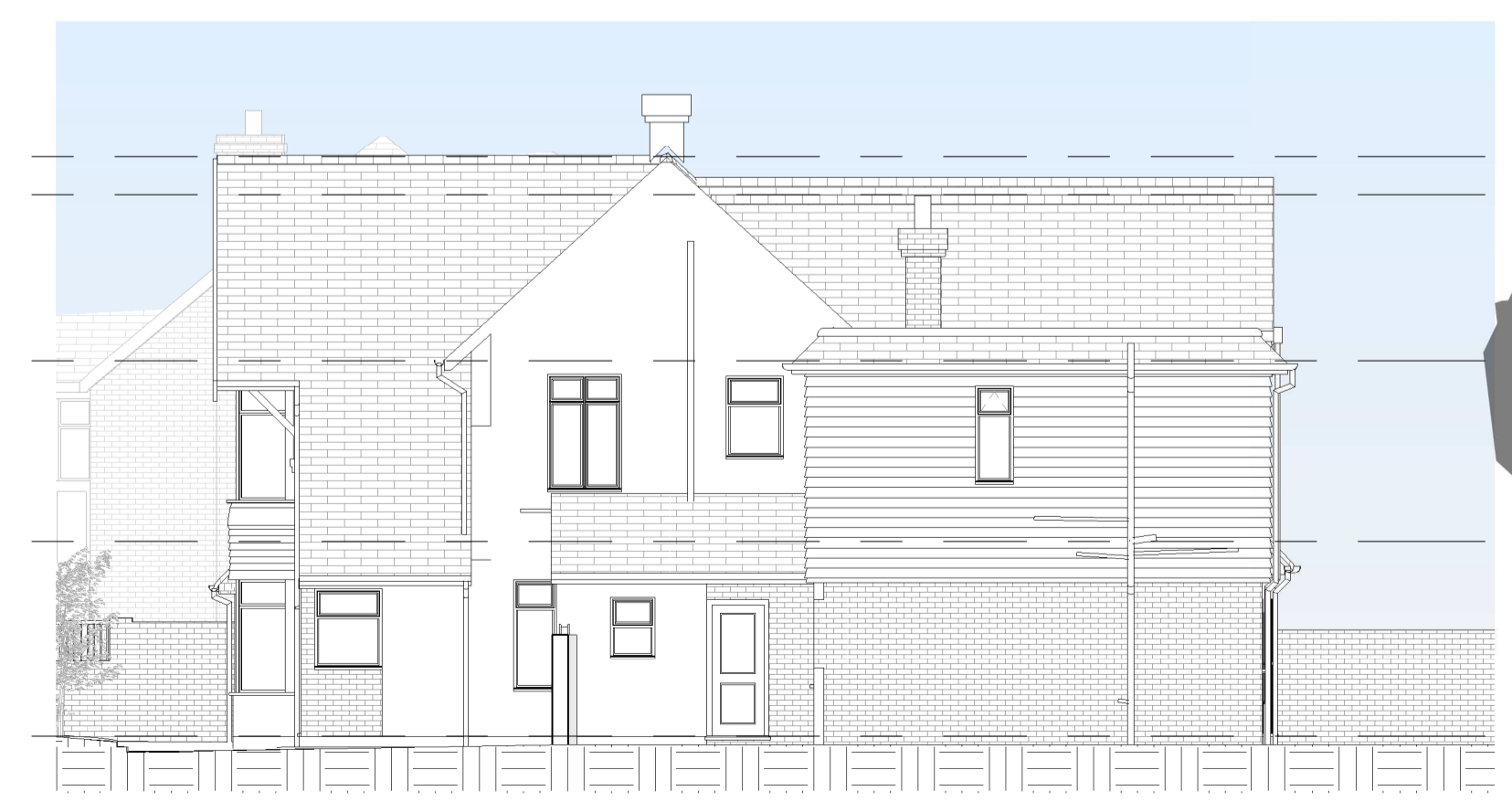
7 Existing Right Elevation 1 : 100