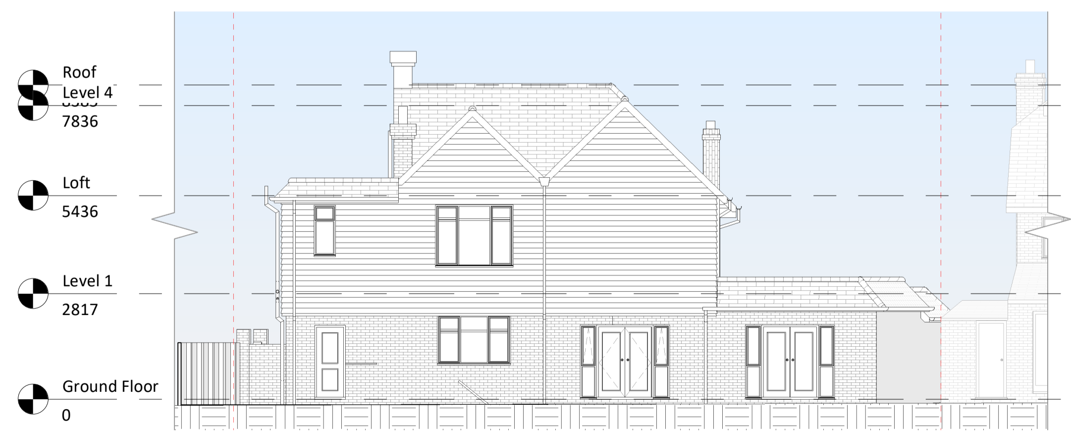
5 Existing Rear Elevation 1 : 100