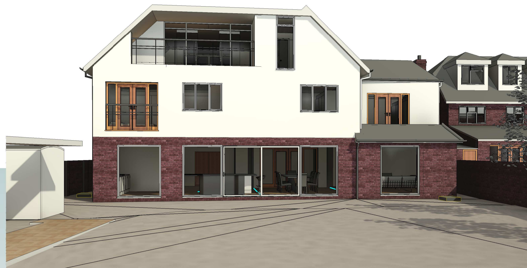
2 3D View - Rear