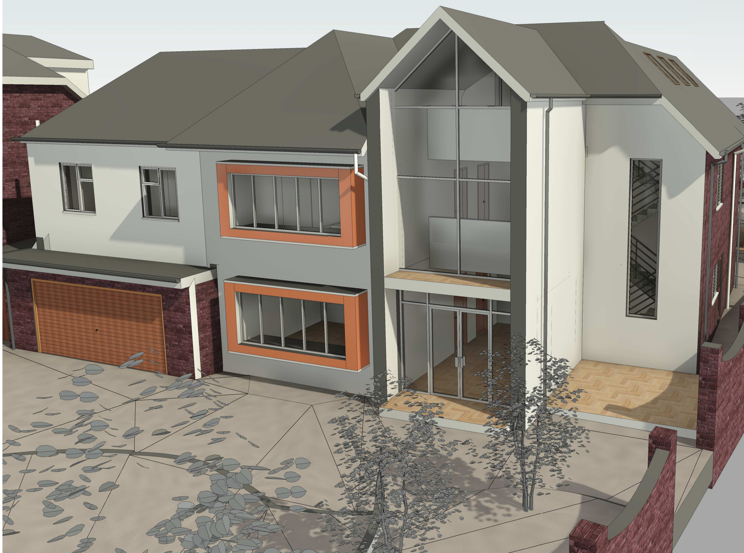
1 3D View - Front