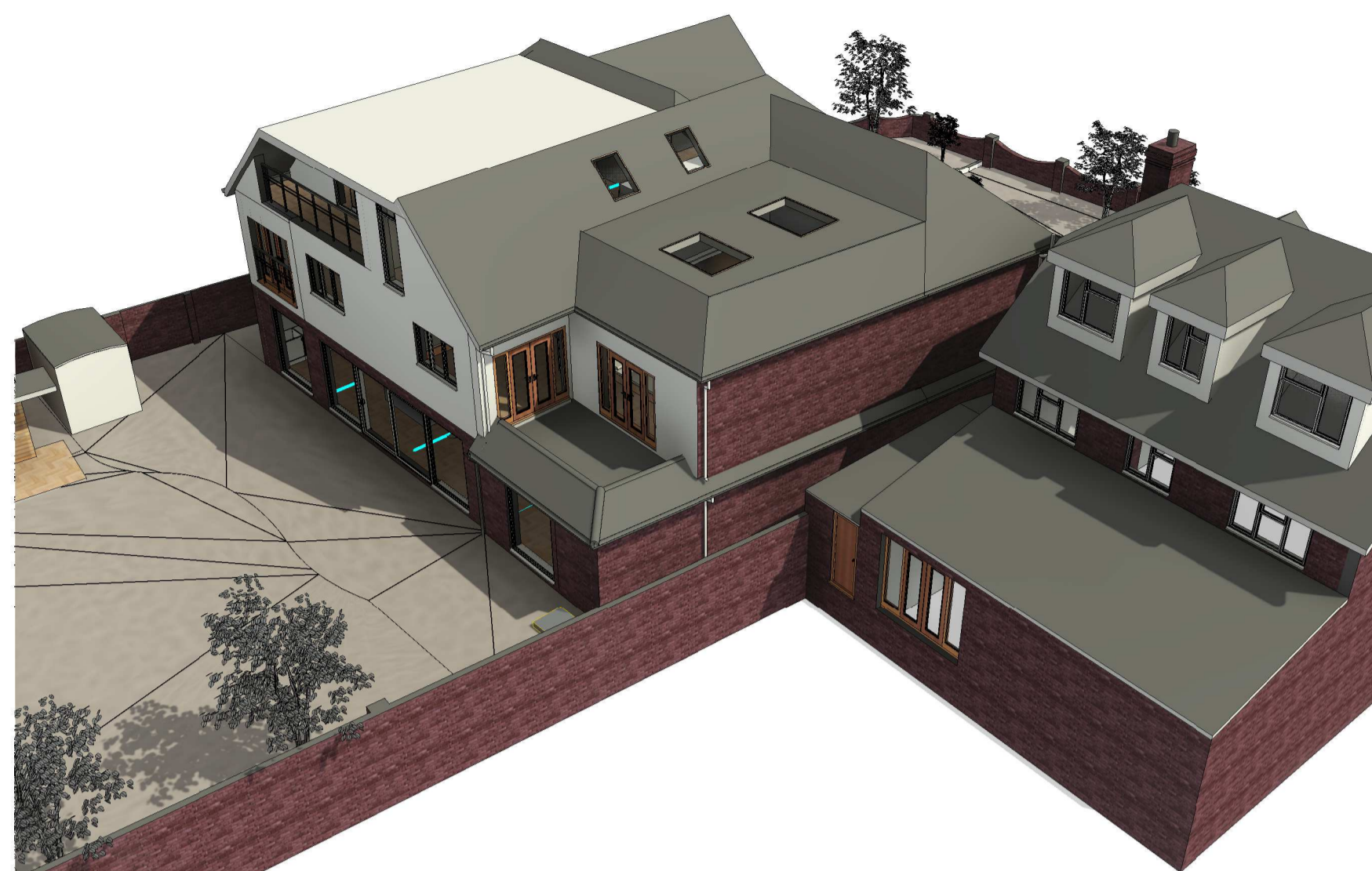
3 3D View - Balconies