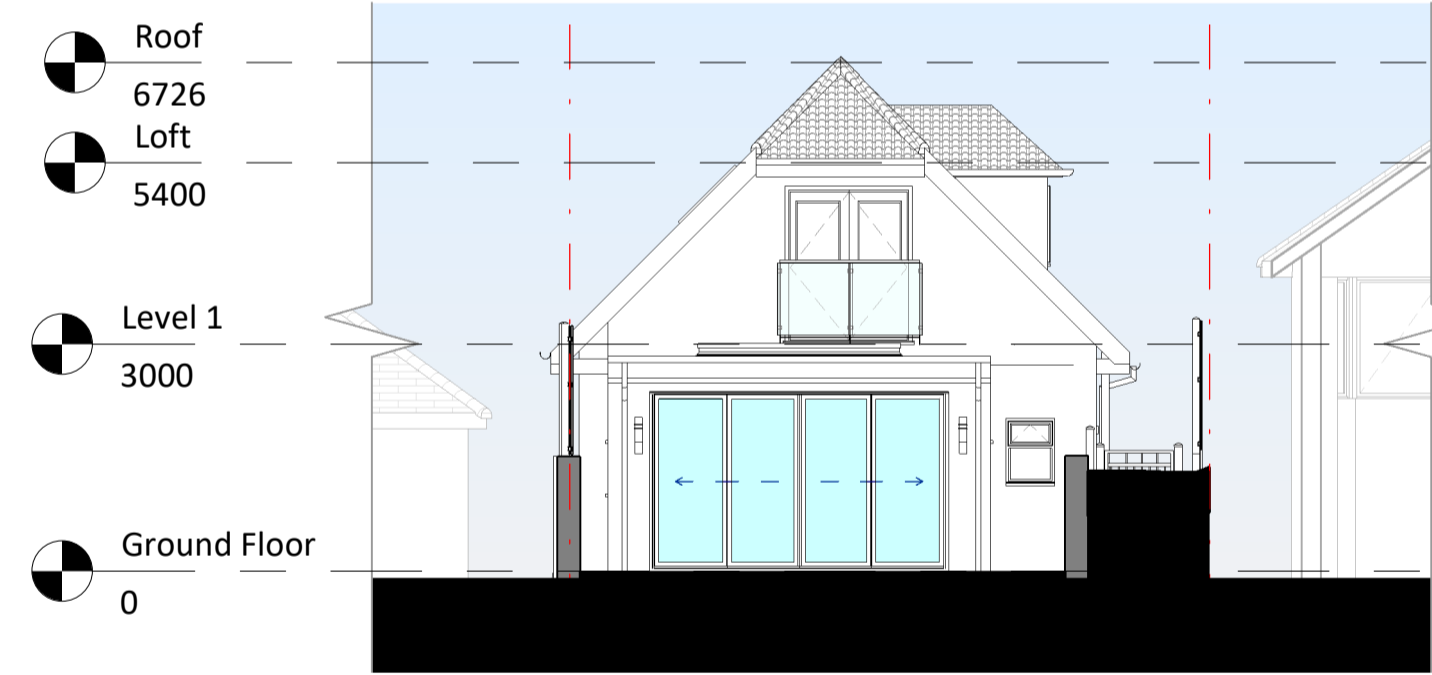
4 Proposed Rear Elevation 1 : 100