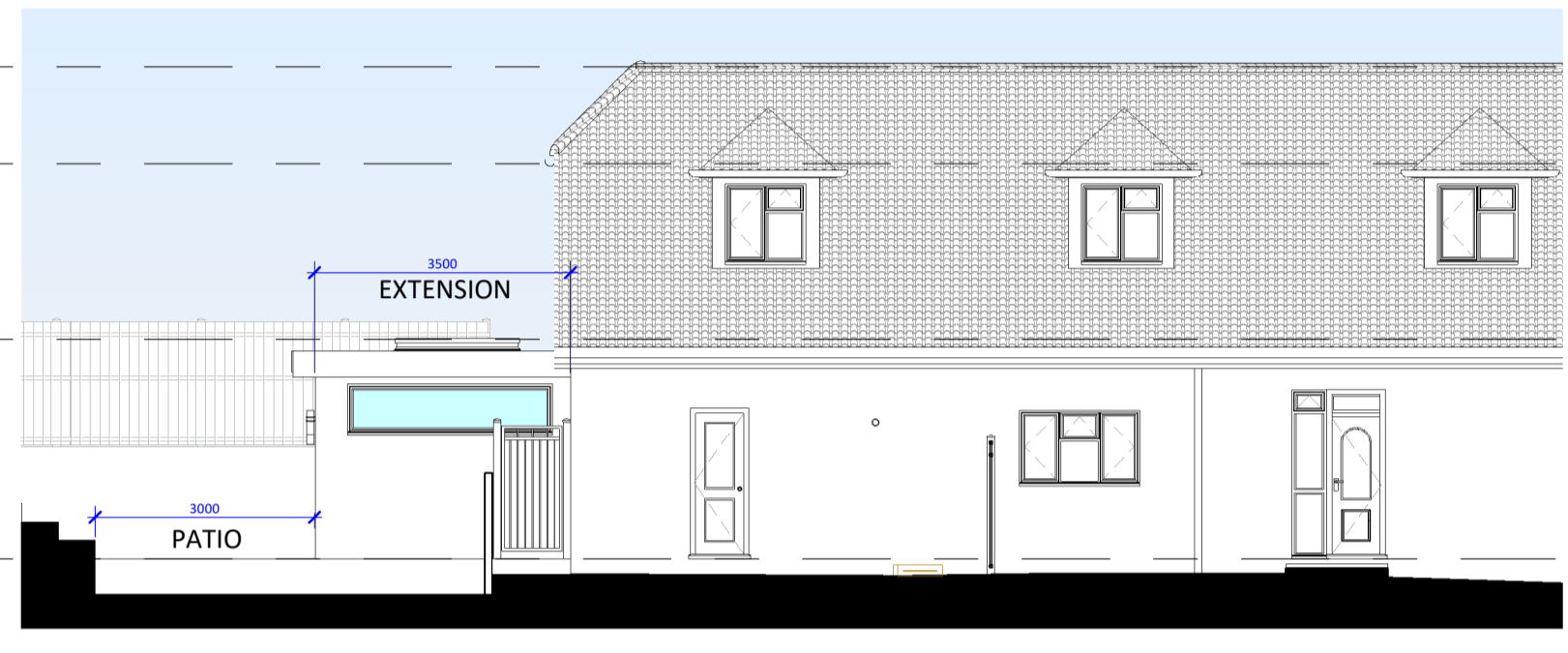
3 Proposed Left Elevation 1 : 100