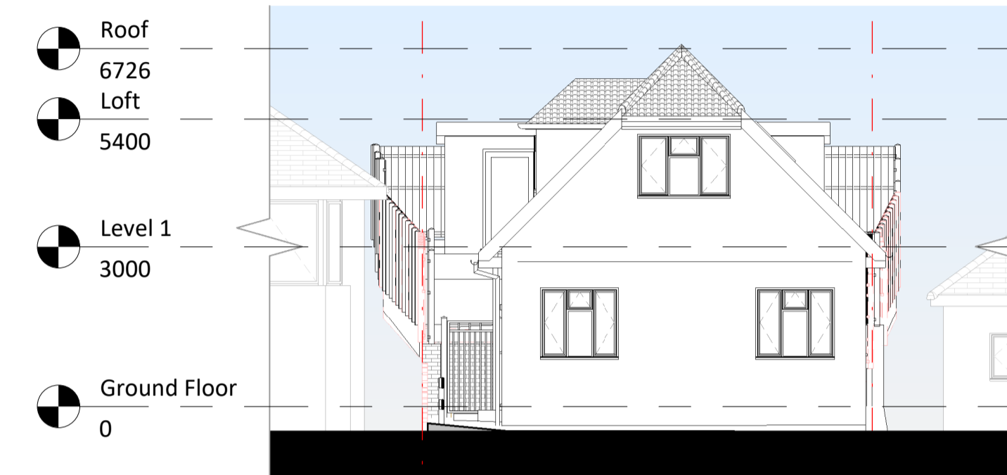
2 Proposed Front Elevation 1 : 100