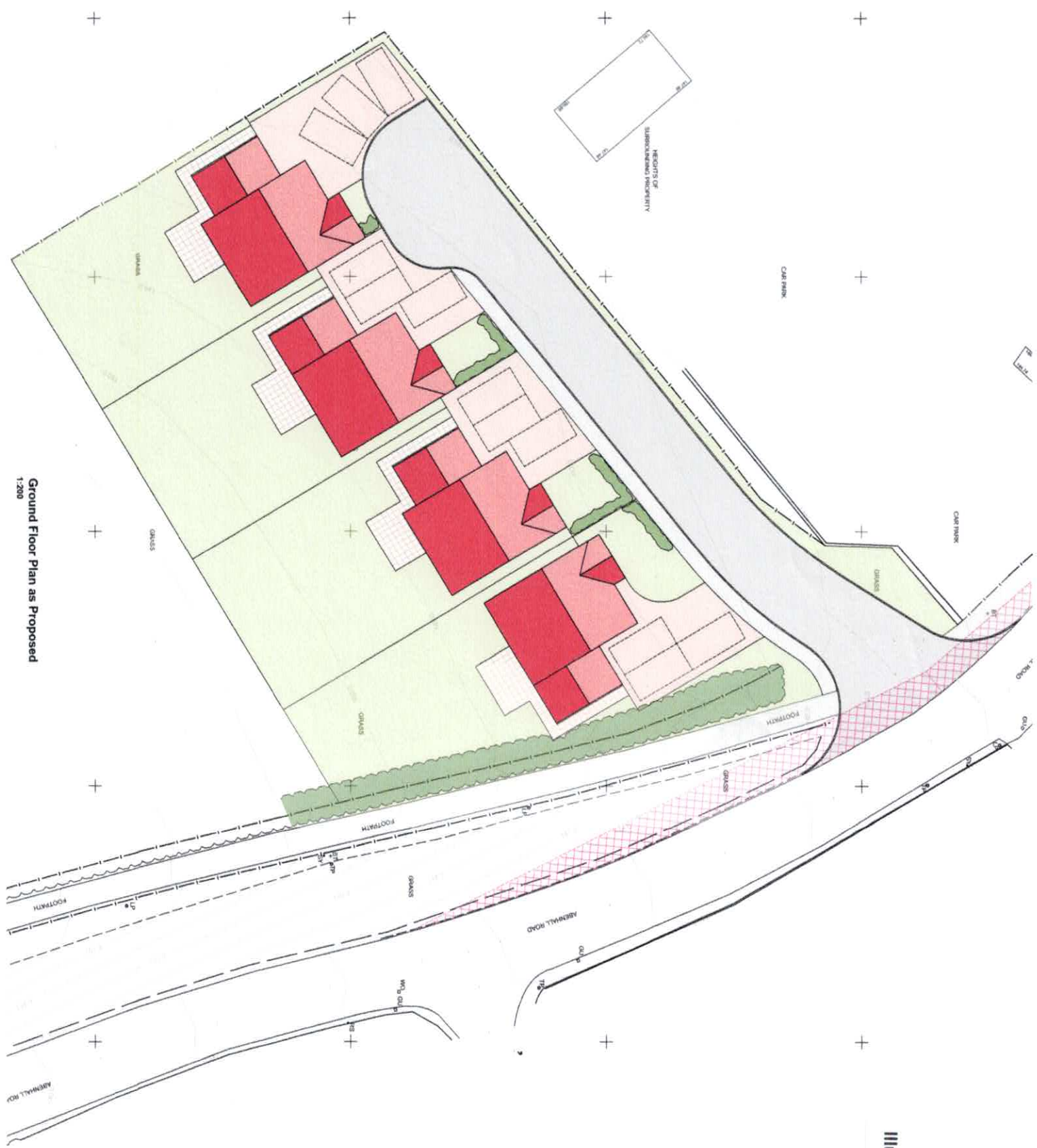
Ground Floor Plan as Proposed 1:200