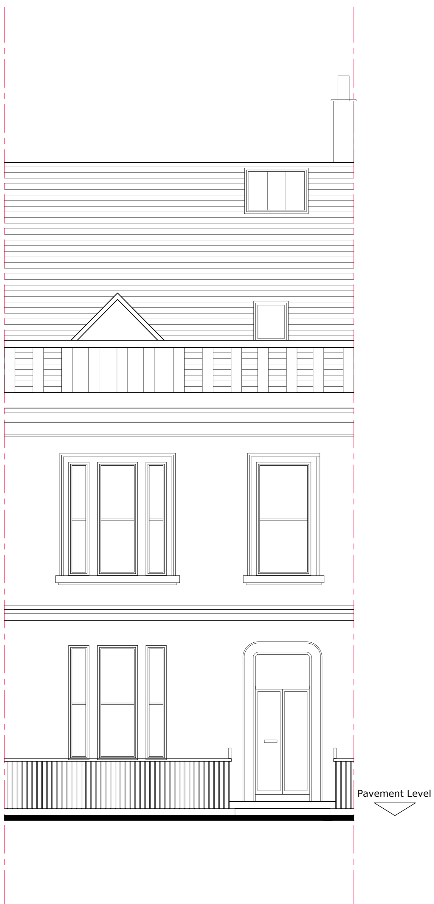
Front Elevation as Existing, 1:50

Notes Do not scale from this drawing. All dimensions to be checked on site prior to construction and any discrepancies reported to the Architect. Copyright reserved.