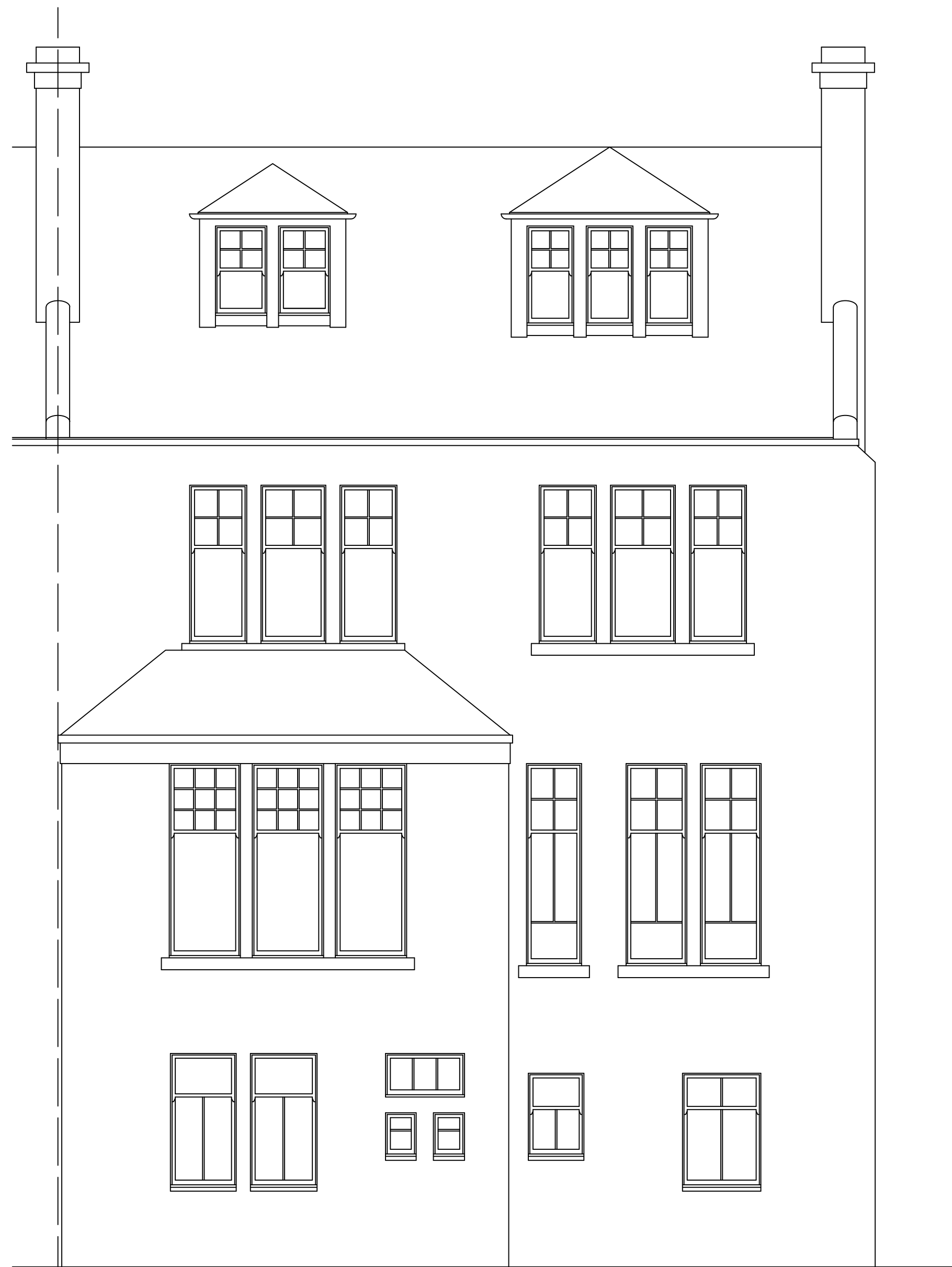
rear / West elevation as existing