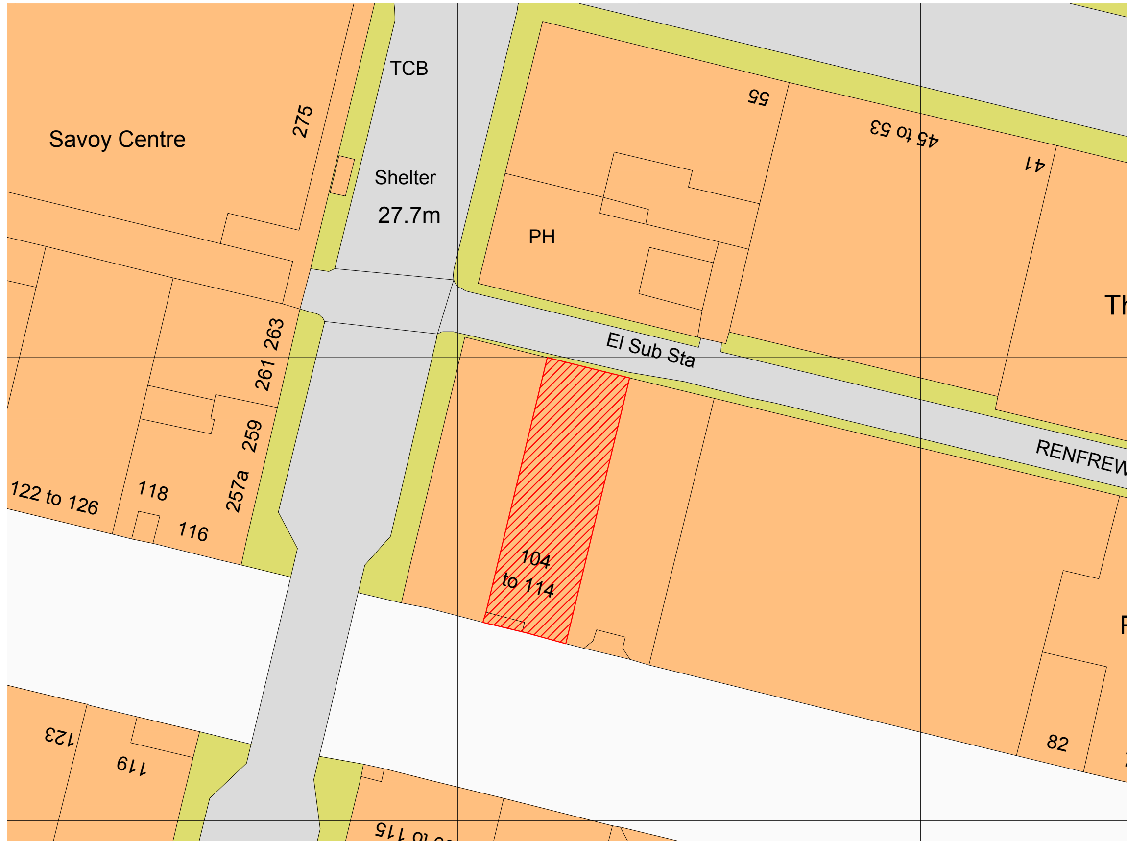
SITE PLAN SCALE 1:200 @ A1, 1:500 @ A3