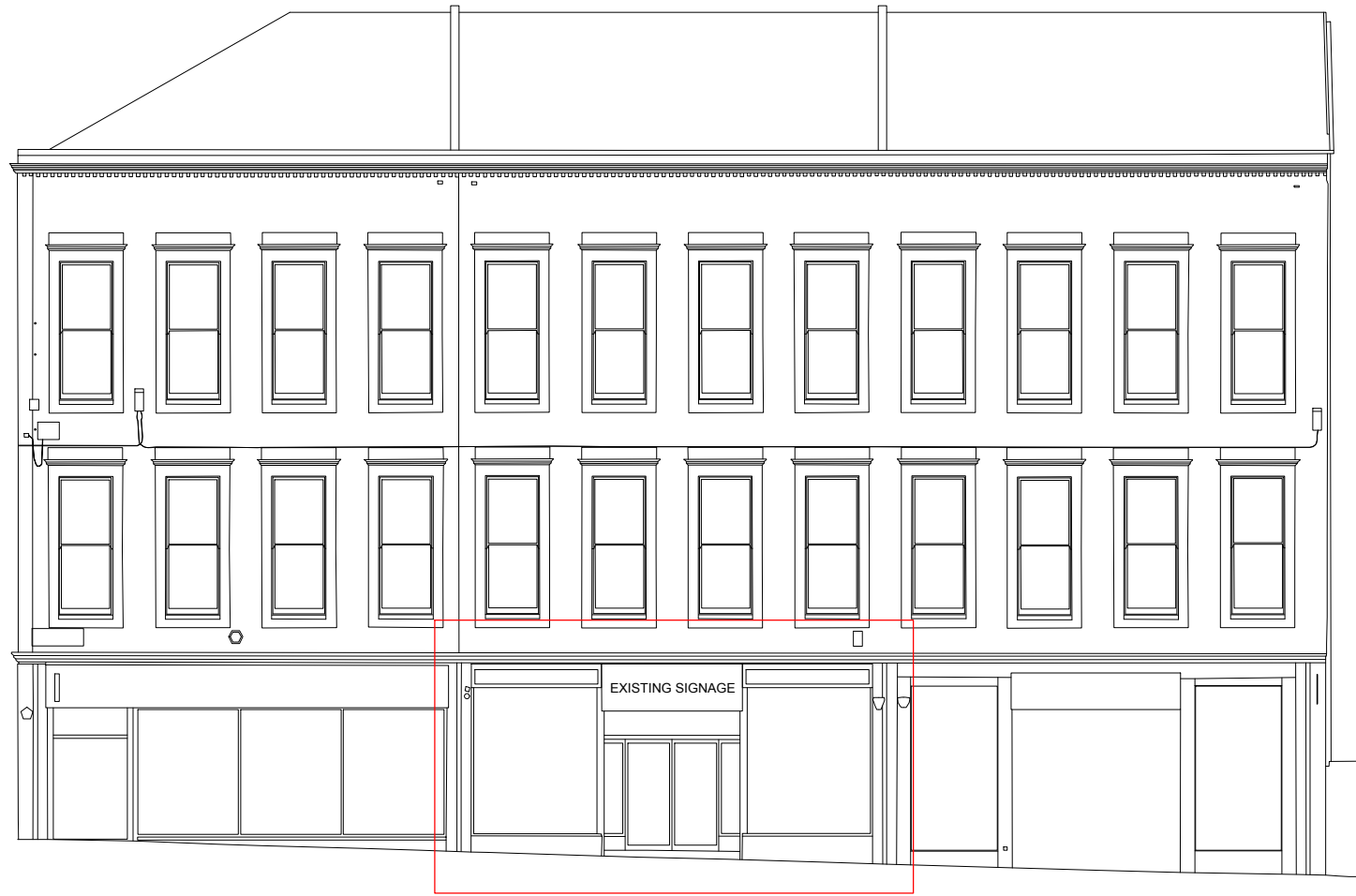
EXISTING FRONT SHOPFRONT ELEVATION SCALE 1:75 @ A1, 1:150 @ A3