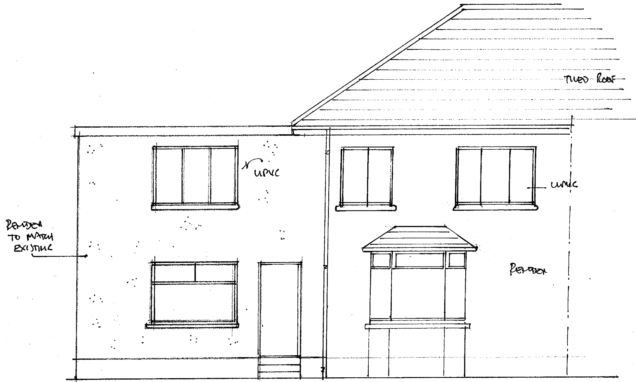
PROPOSED FRONT ELEVATION 1:50 @A3