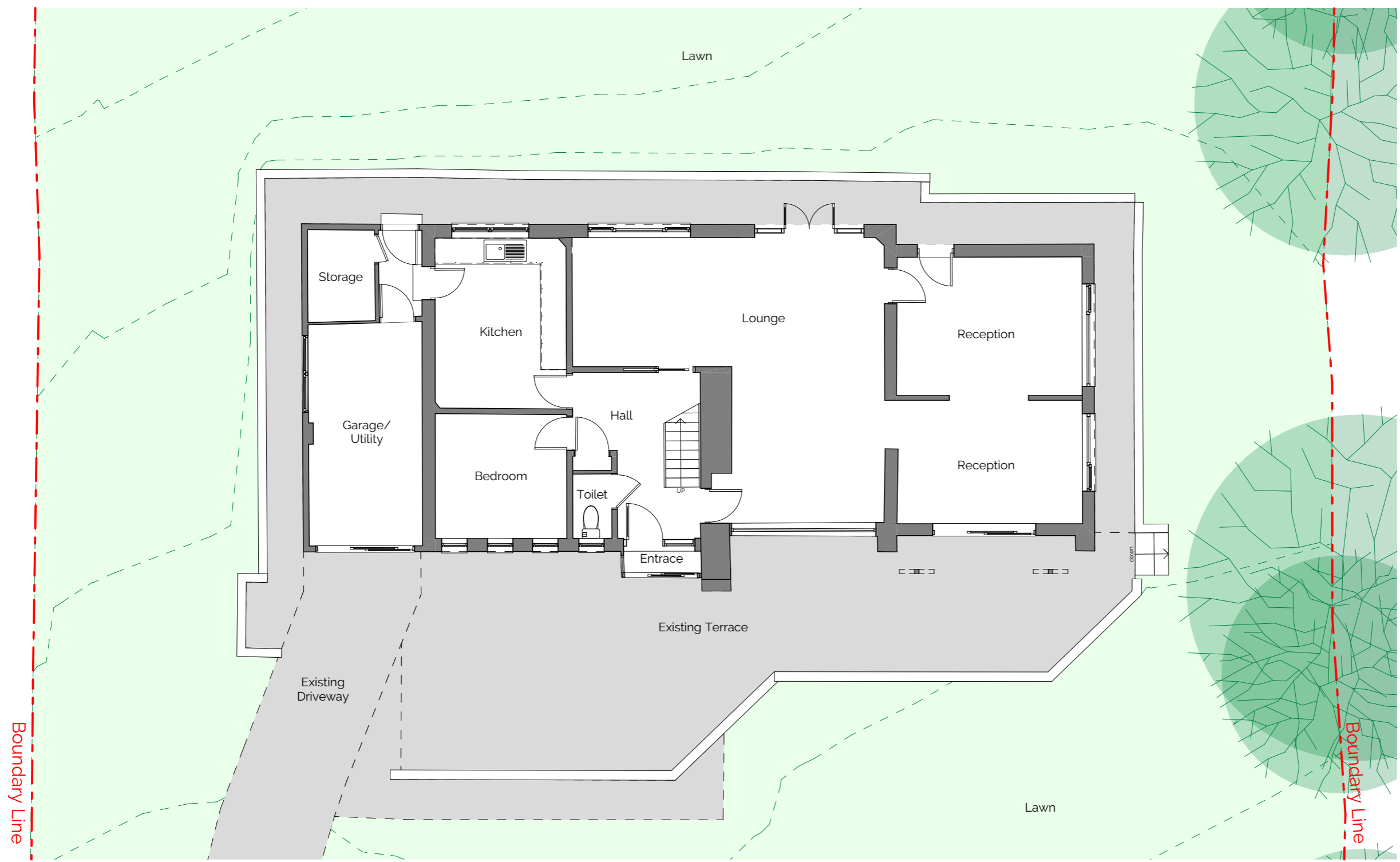
Existing Ground Floor Plan 1:100

© Copyright: Mattinson Associates Ltd. 2023 No reproduction, transmission or correspondence to third parties of all or any part of this document or the information it contains is permitted without the prior written consent of Mattinson Associates Ltd. This drawing is not to be scaled for the purpose of setting out. Any discrepancies found in this drawing, or between this drawing and another must be reported to Mattinson Associates Ltd. immediately.