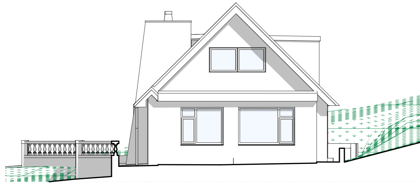
Existing East Elevation 1:100