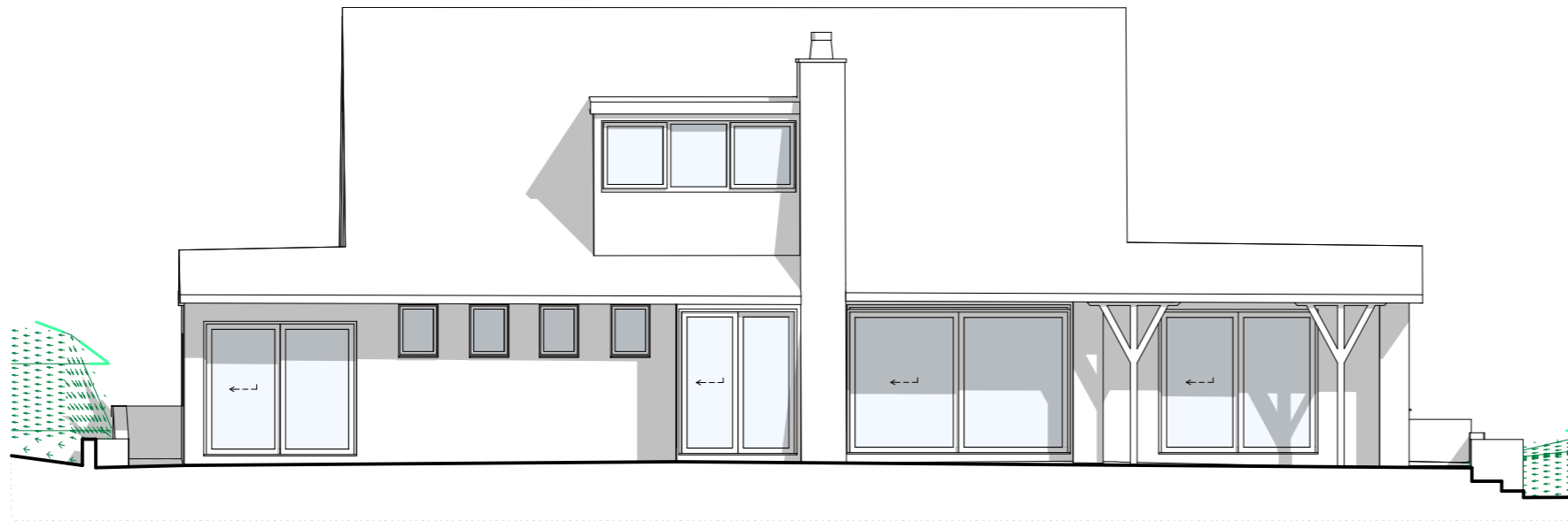
Existing South Elevation 1:100