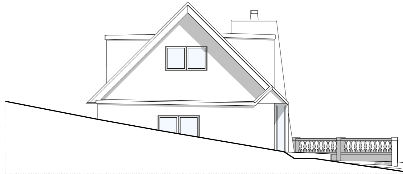
Existing West Elevation 1:100