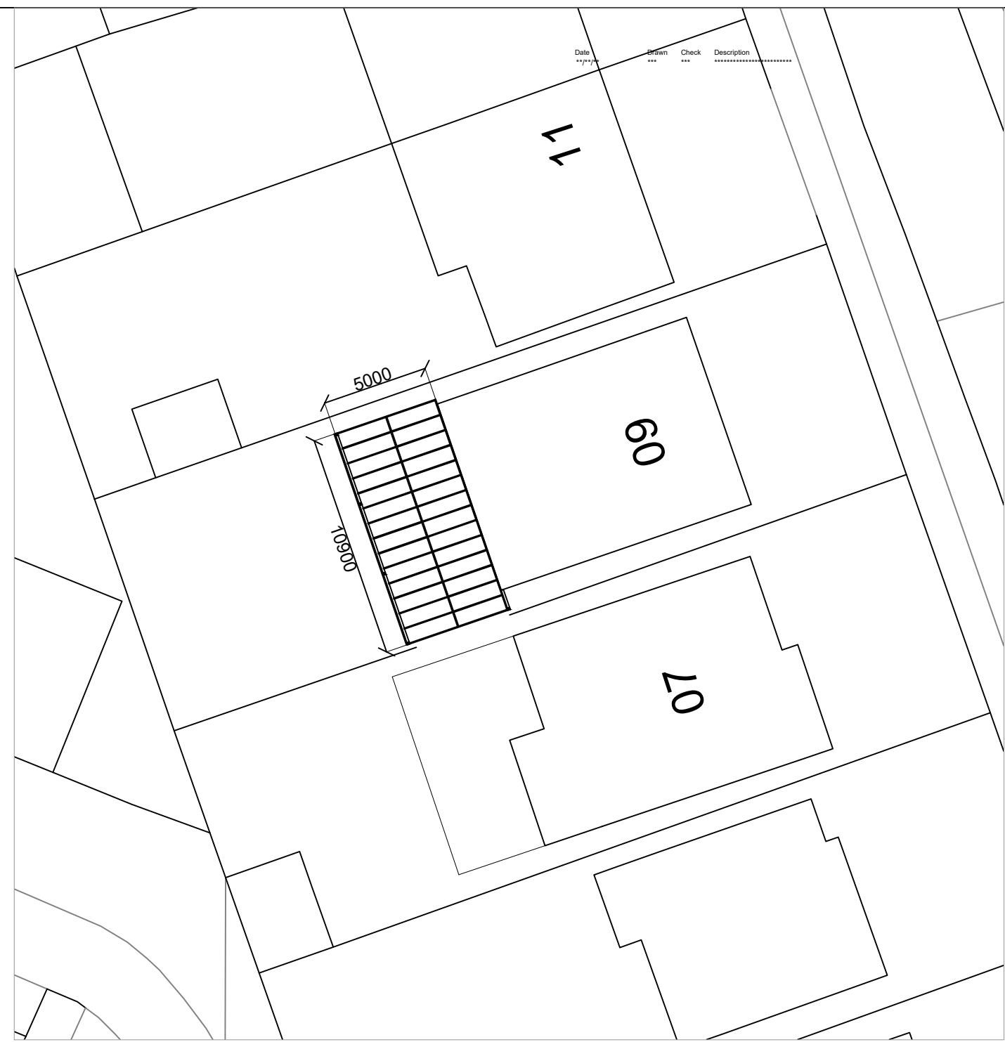
PROPOSED SITE PLAN 1:250