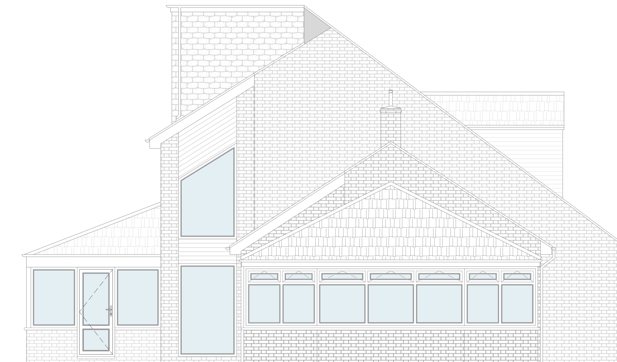
EXISTING LEFT SIDE ELEVATION SCALE 1:50