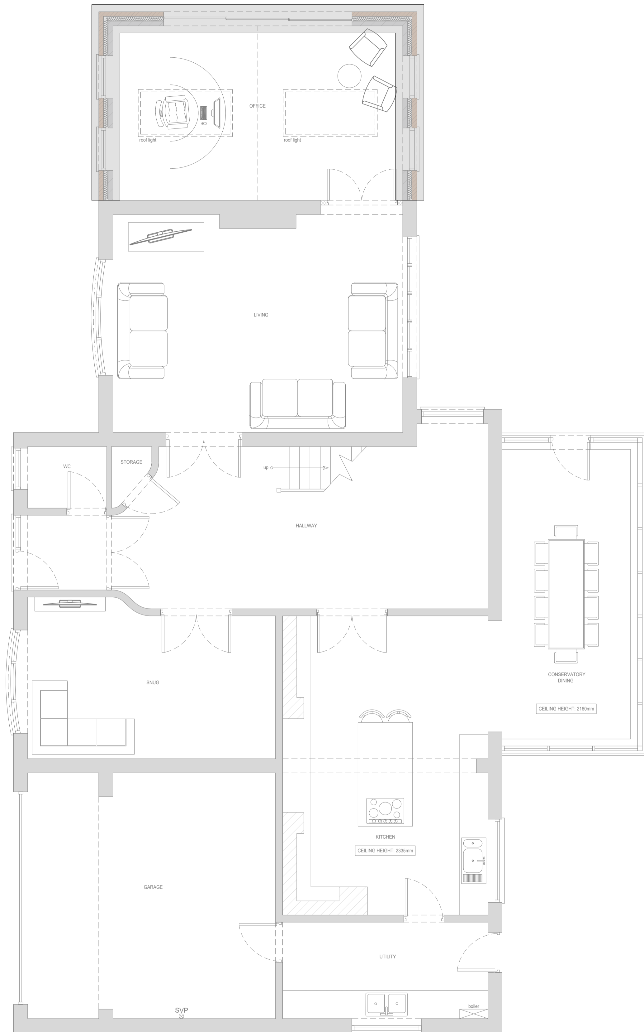
PROPOSED FOUNDATION PLAN SCALE 1:50