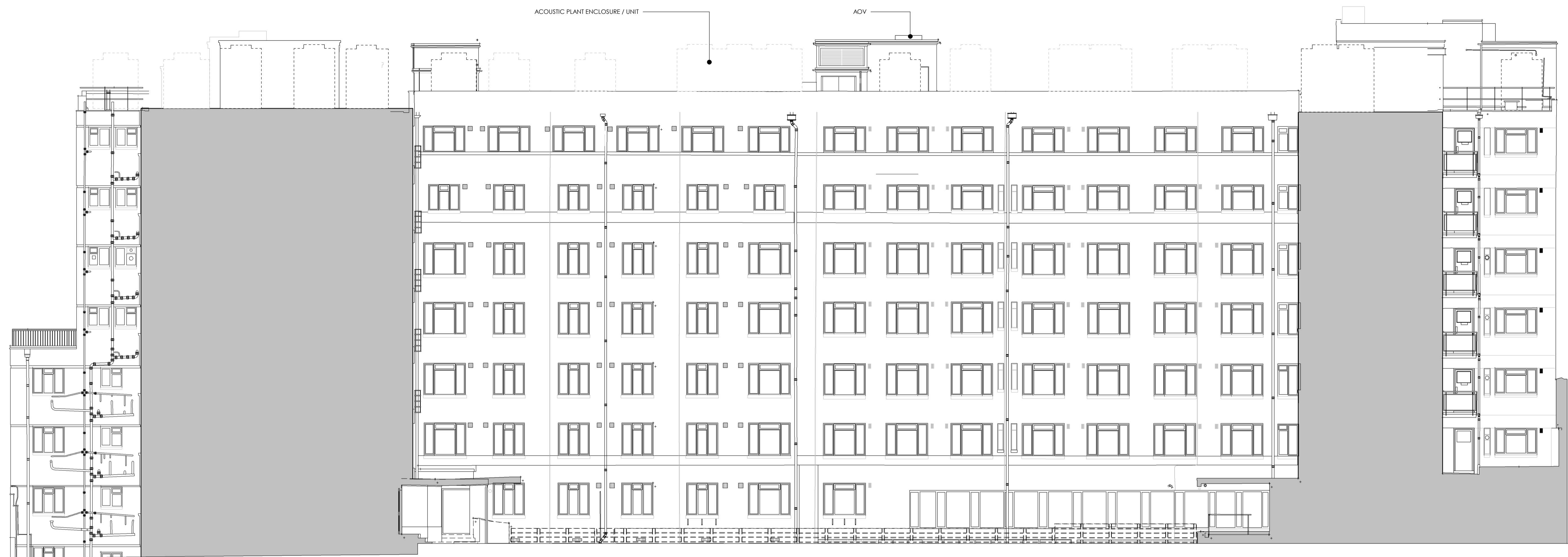
PLANT APP SOUTH EAST 1:100