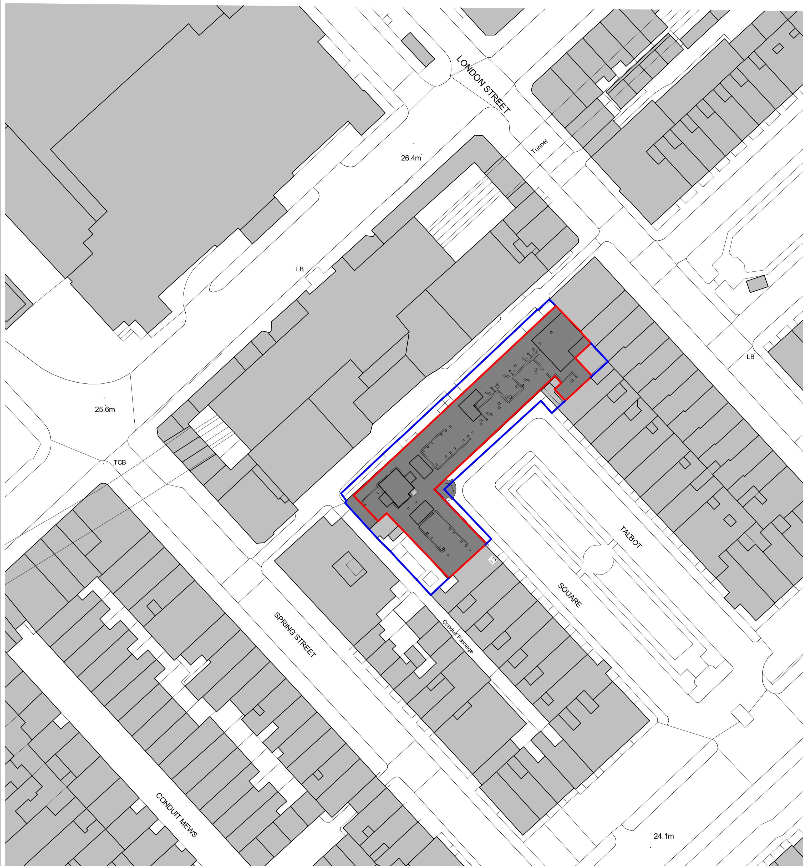
Block Plan Existing 1 : 500