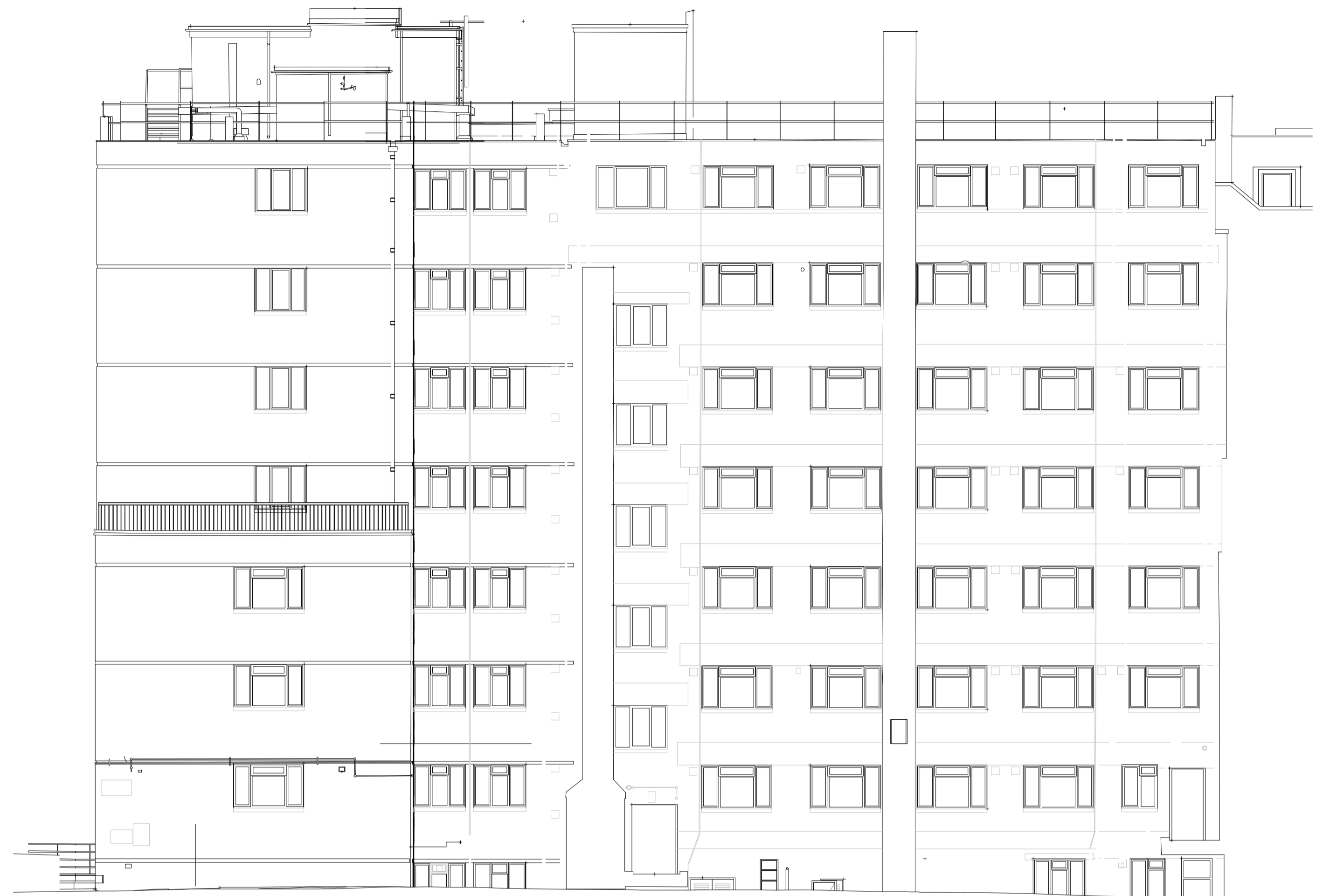
SOUTH WEST 1:100