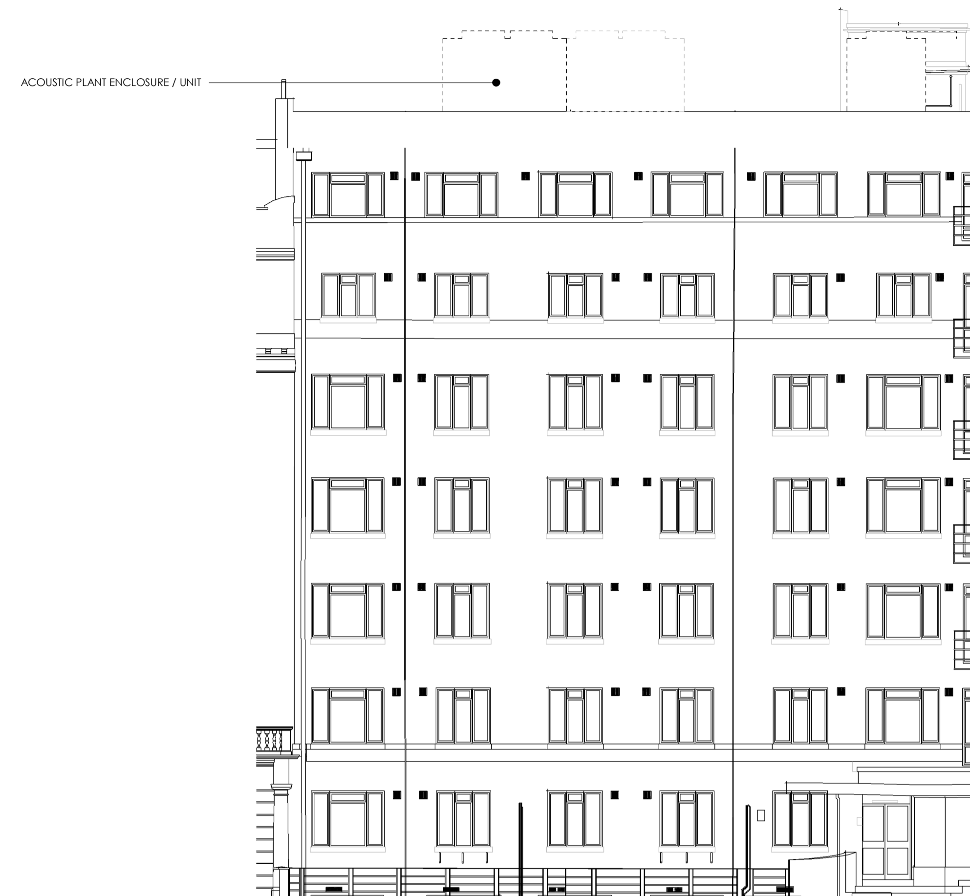
NORTH EAST SECTIONAL ELEVATION - PROPOSED 1 : 100