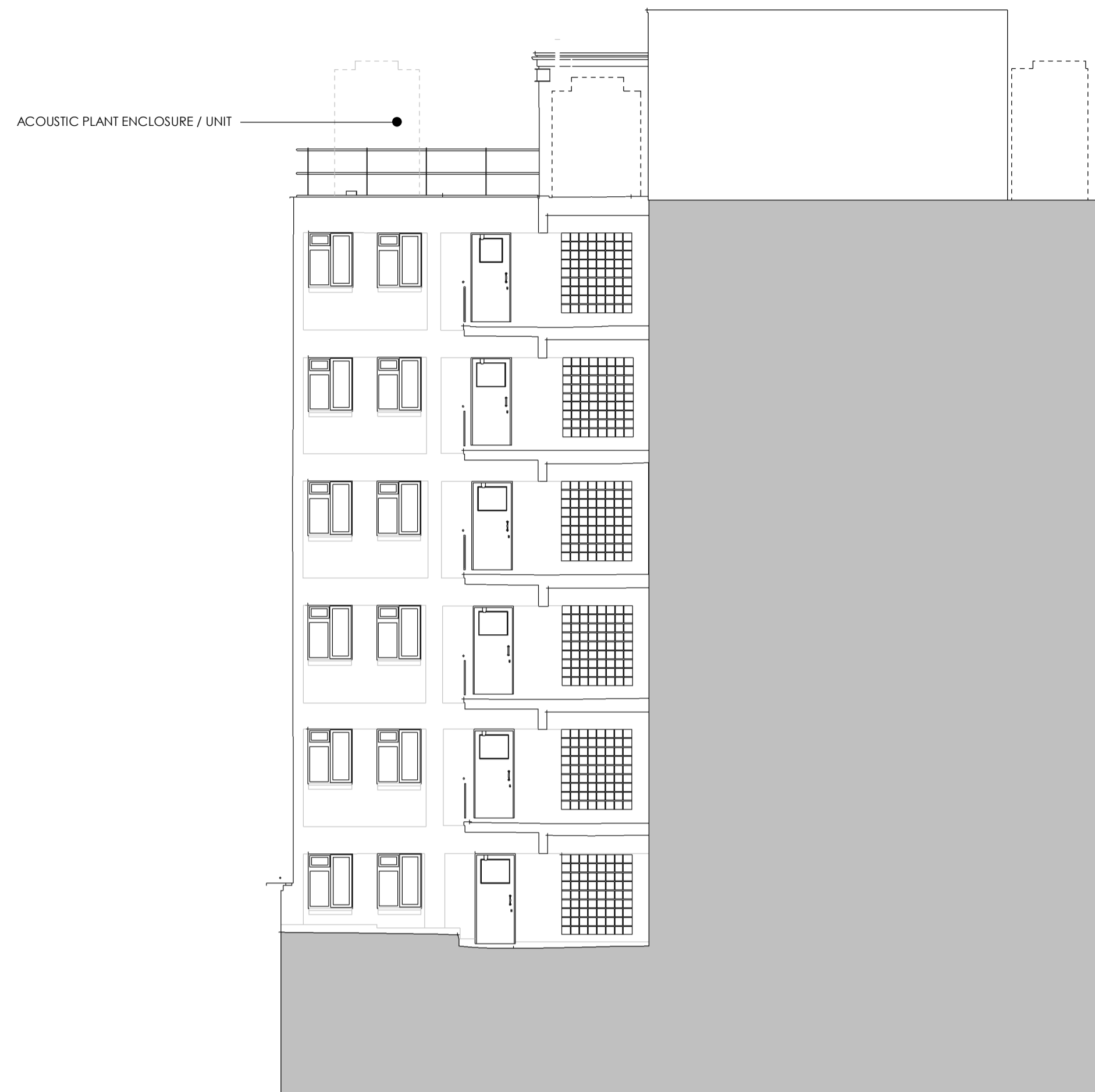
NORTH EAST ELEVATION - PROPOSED 1 : 100