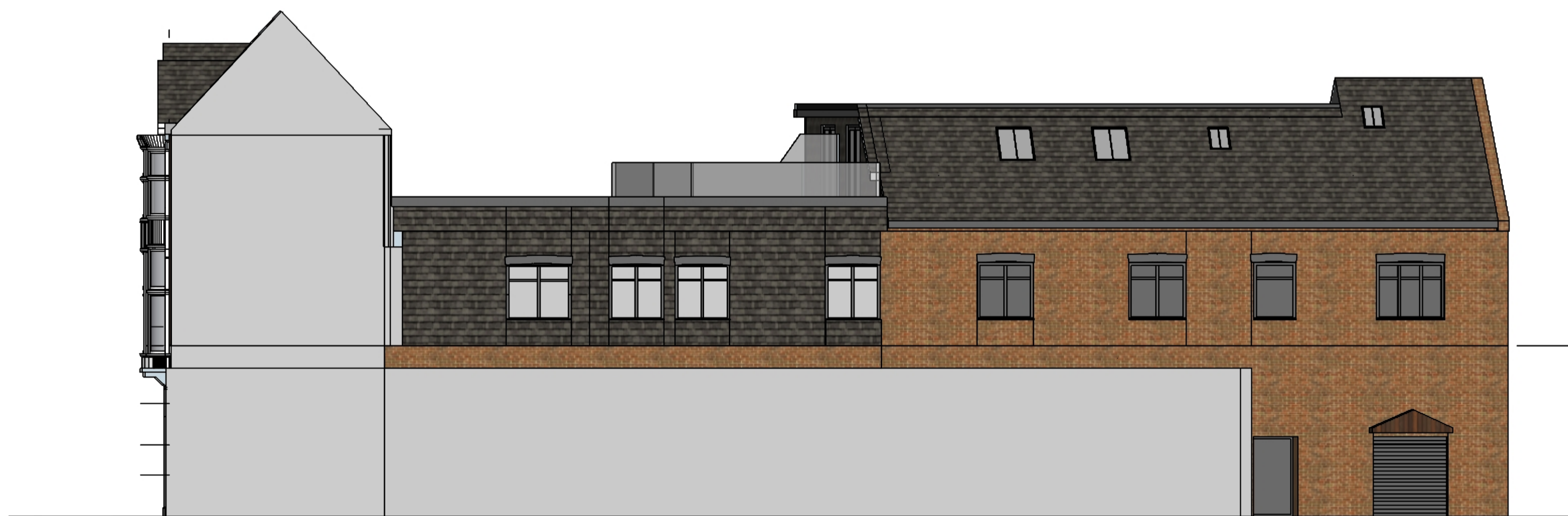
NORTH SIDE ELEVATION