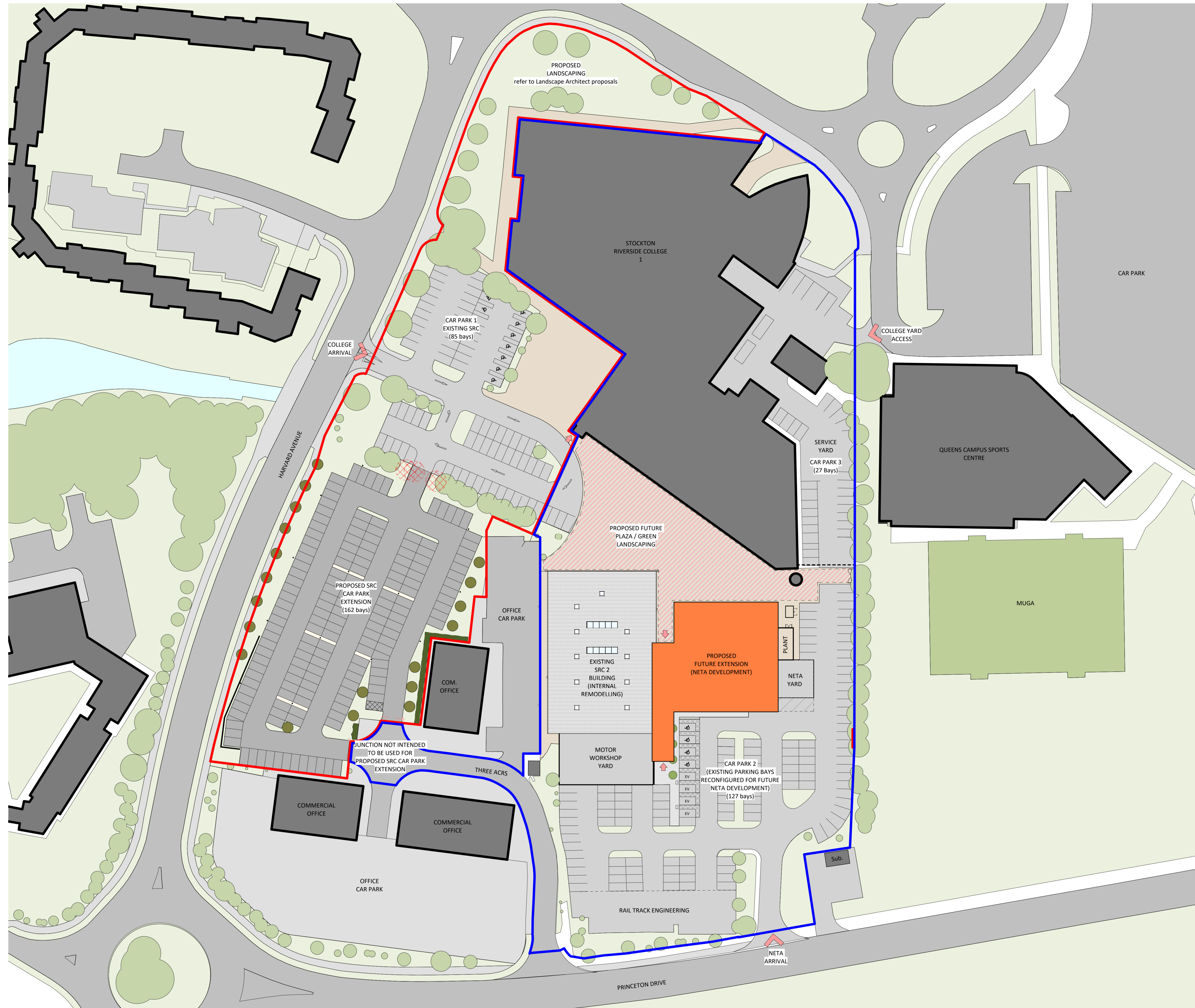
1. Proposed Masterplan SCALE - 1 : 500@A1