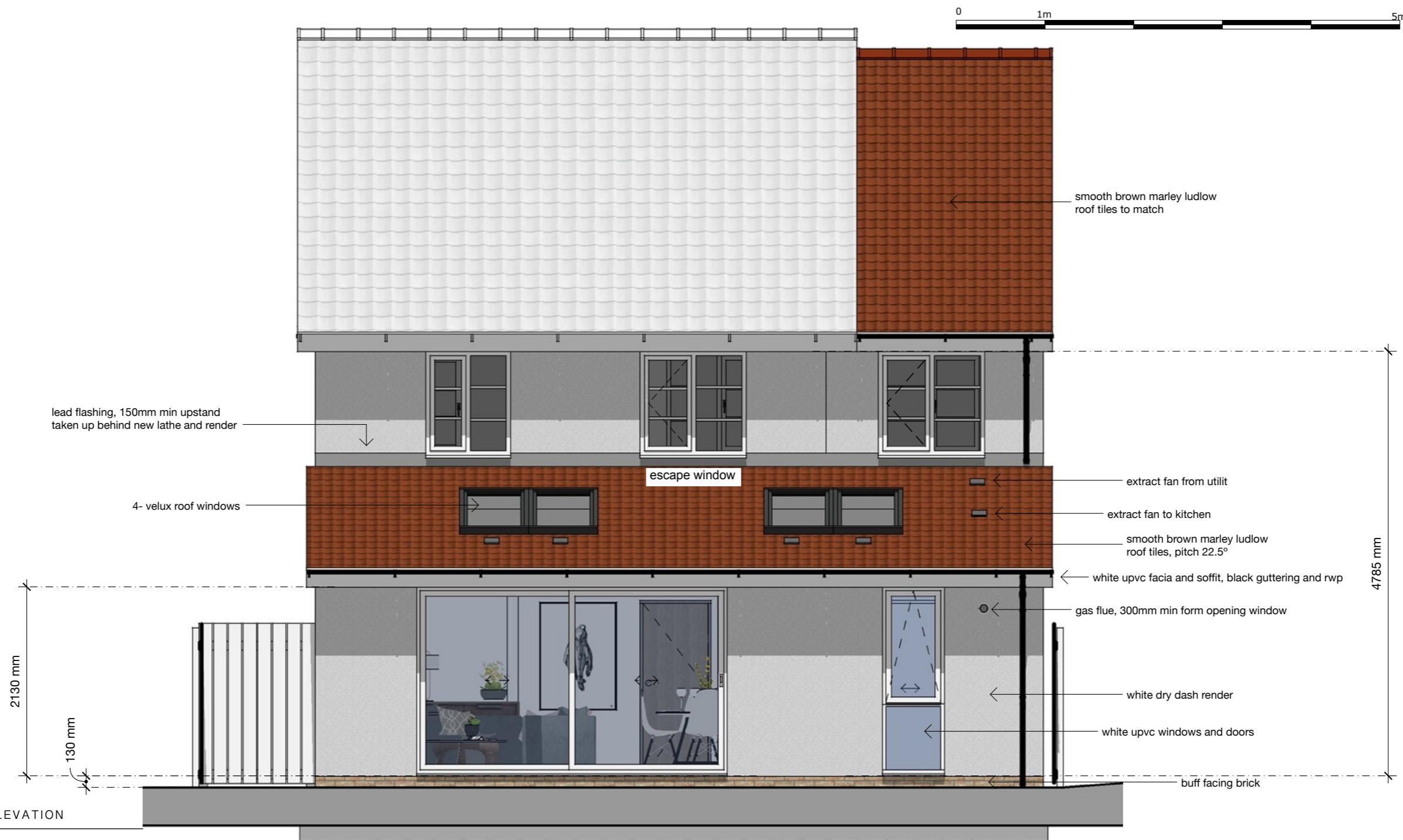
P :: PROPOSED REAR ELEVATION 6 scale: 1:50