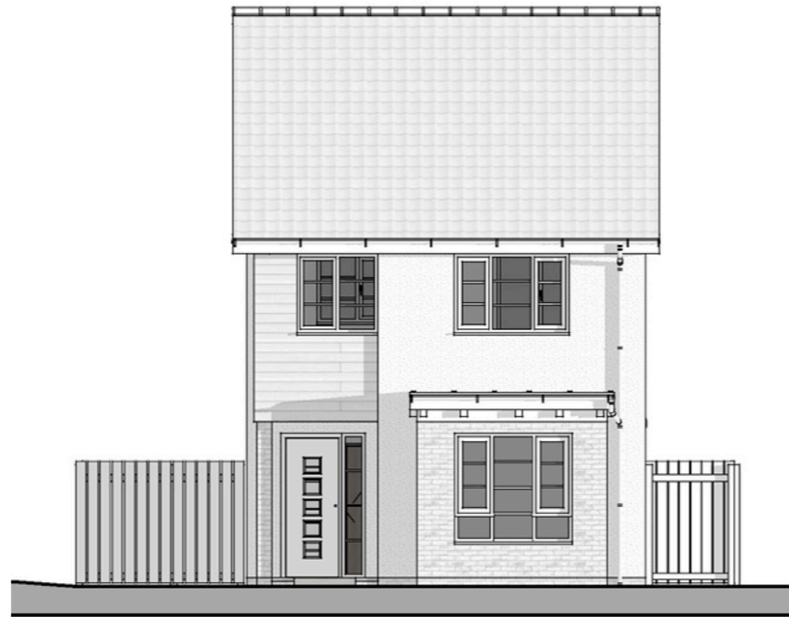
E :: EXISTING FRONT ELEVATION