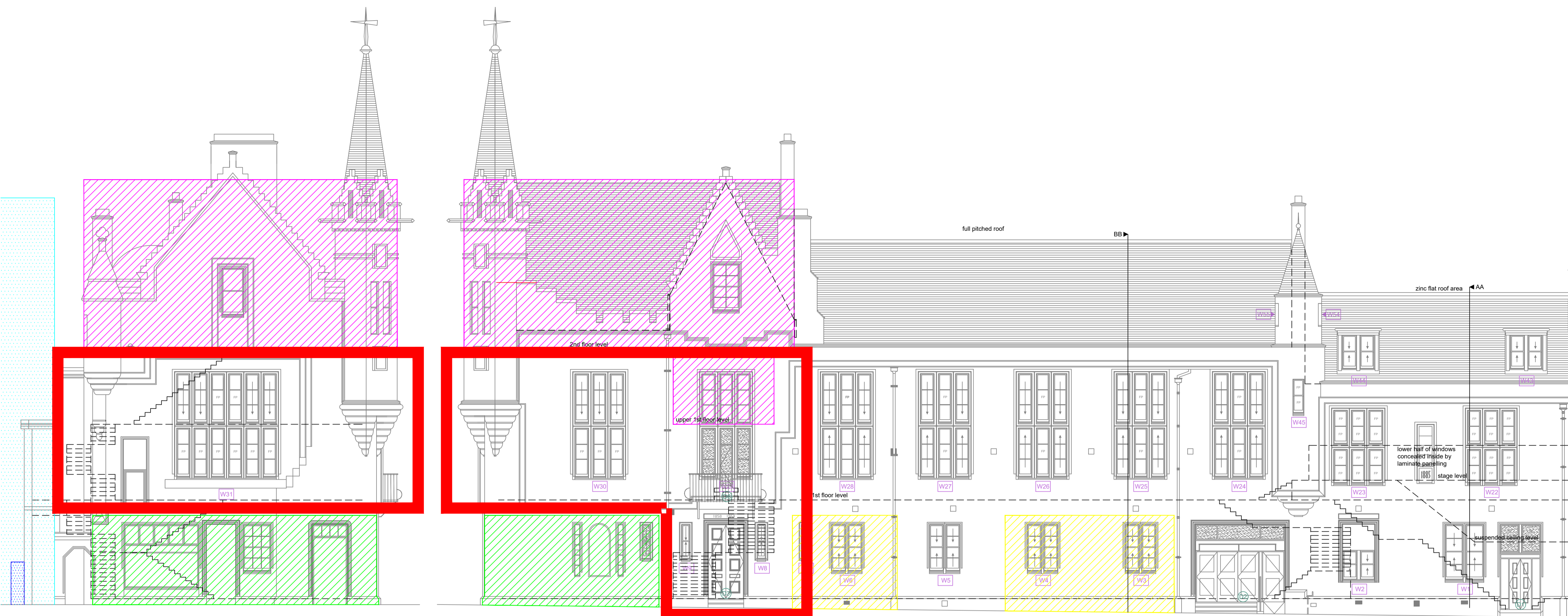
END ELEVATION - SOUTH STREET

Following any Asbestos related incident, construction works must not recommence until the Construction Compliance Team have given approval in writing to do so.