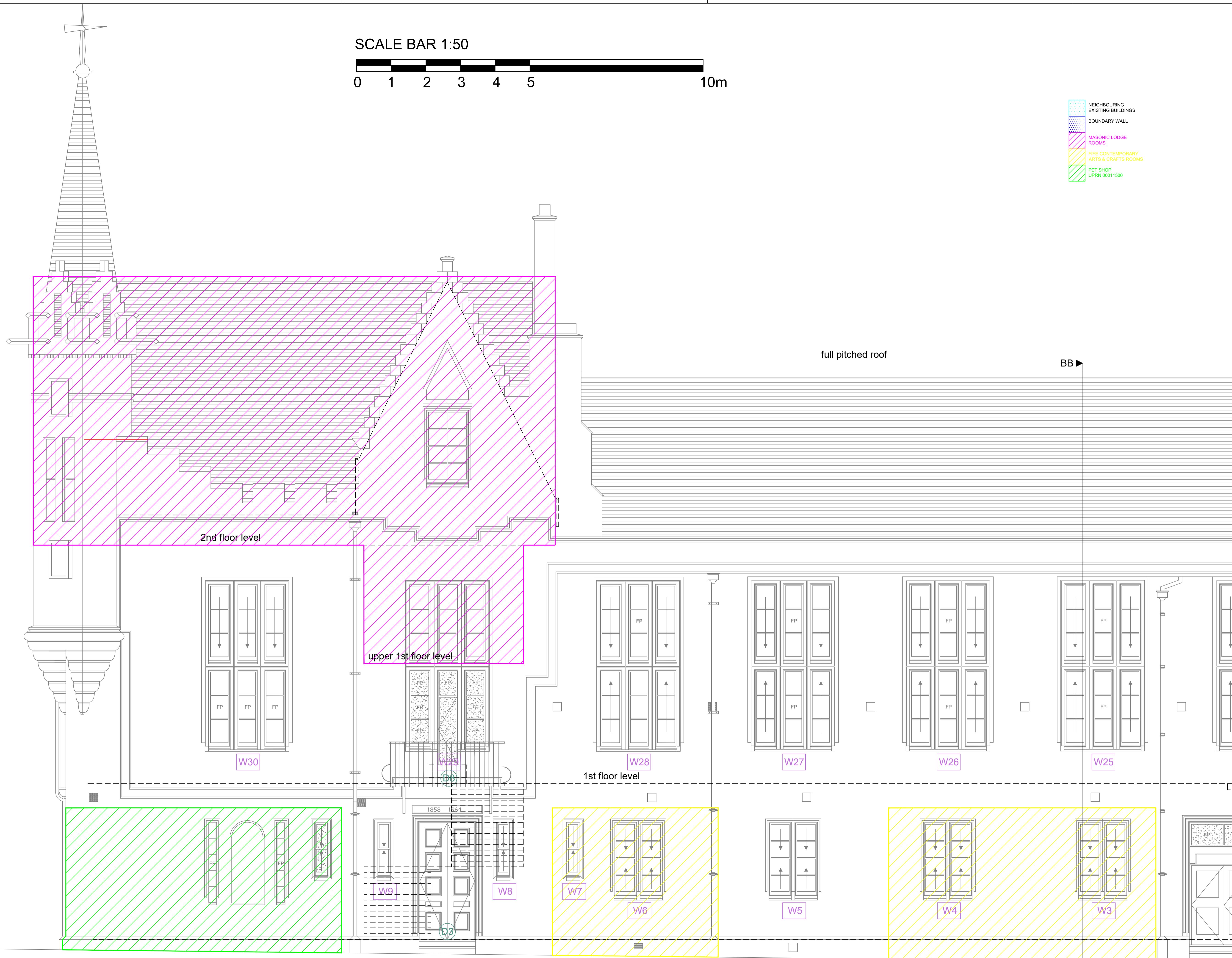
FRONT ELEVATION - QUEENS GARDENS