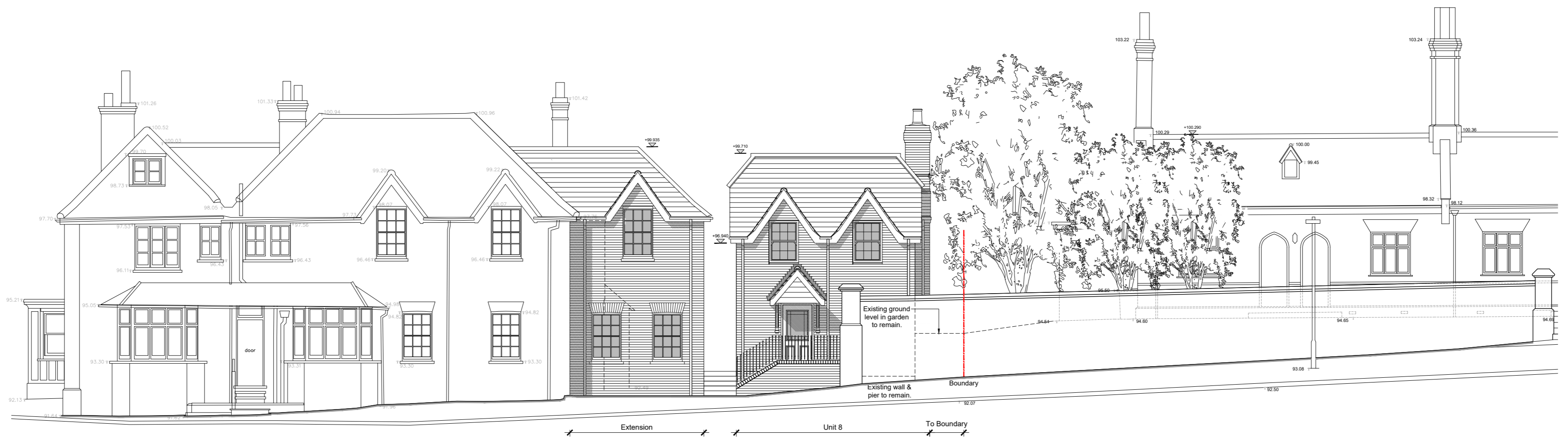
PROPOSED ELEVATION 1