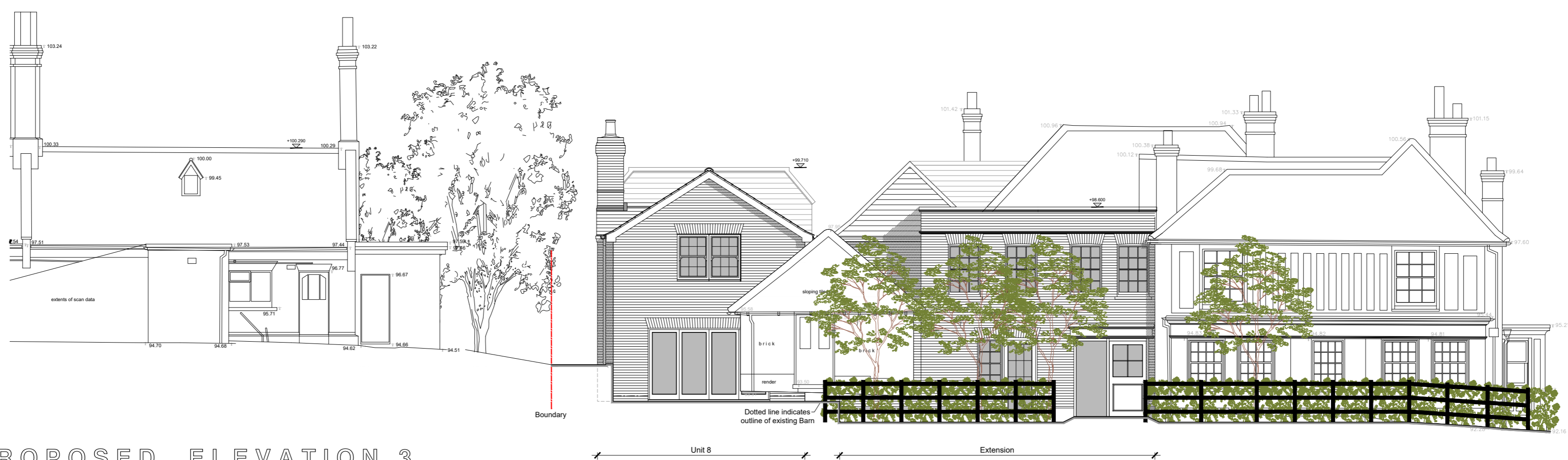
PROPOSED ELEVATION 3