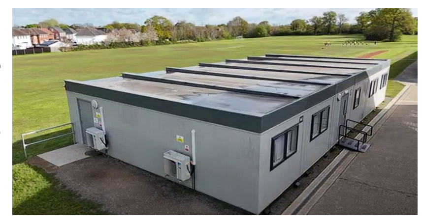
Classroom Unit M1 & M2

This application proposes no change to site access (vehicle or pedestrian), car parking numbers, servicing areas or boundary treatments.