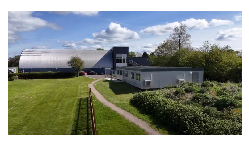
Identical material finish to both modular units. Colours are complimentary to the surrounding buildings.