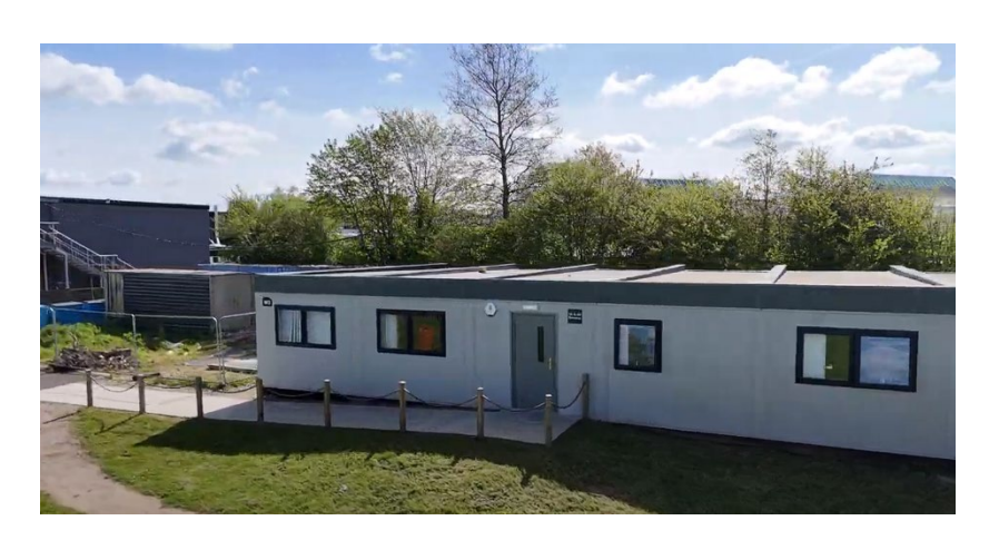
Classroom Unit M3 & M4