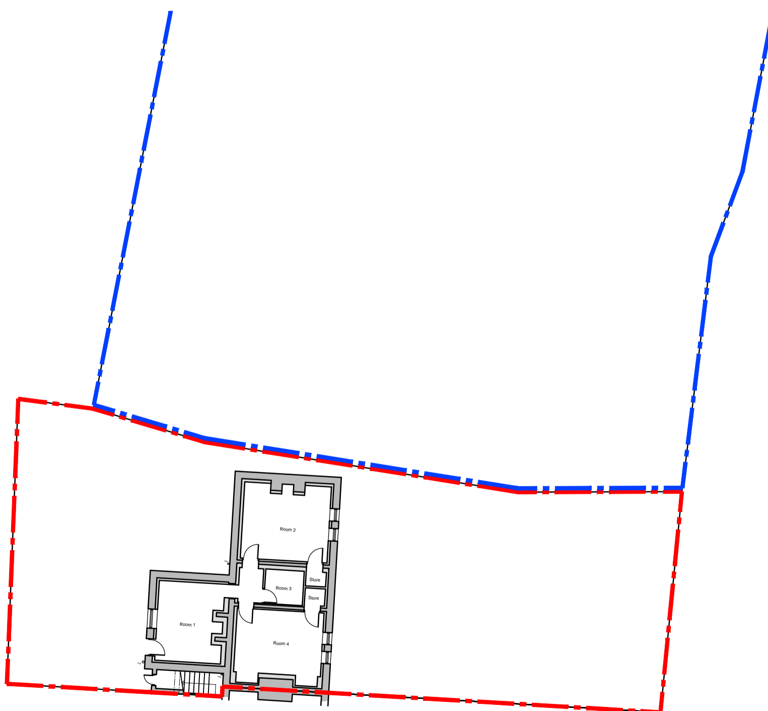
Existing Site Plan 1:200