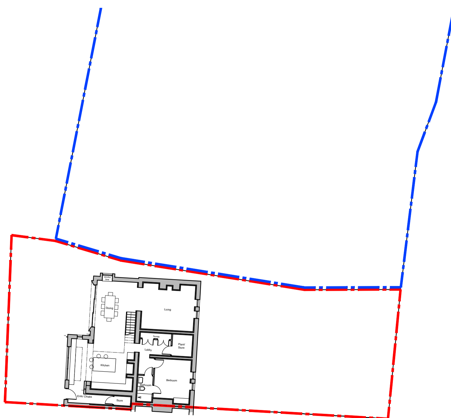
Proposed Site Plan 1:200