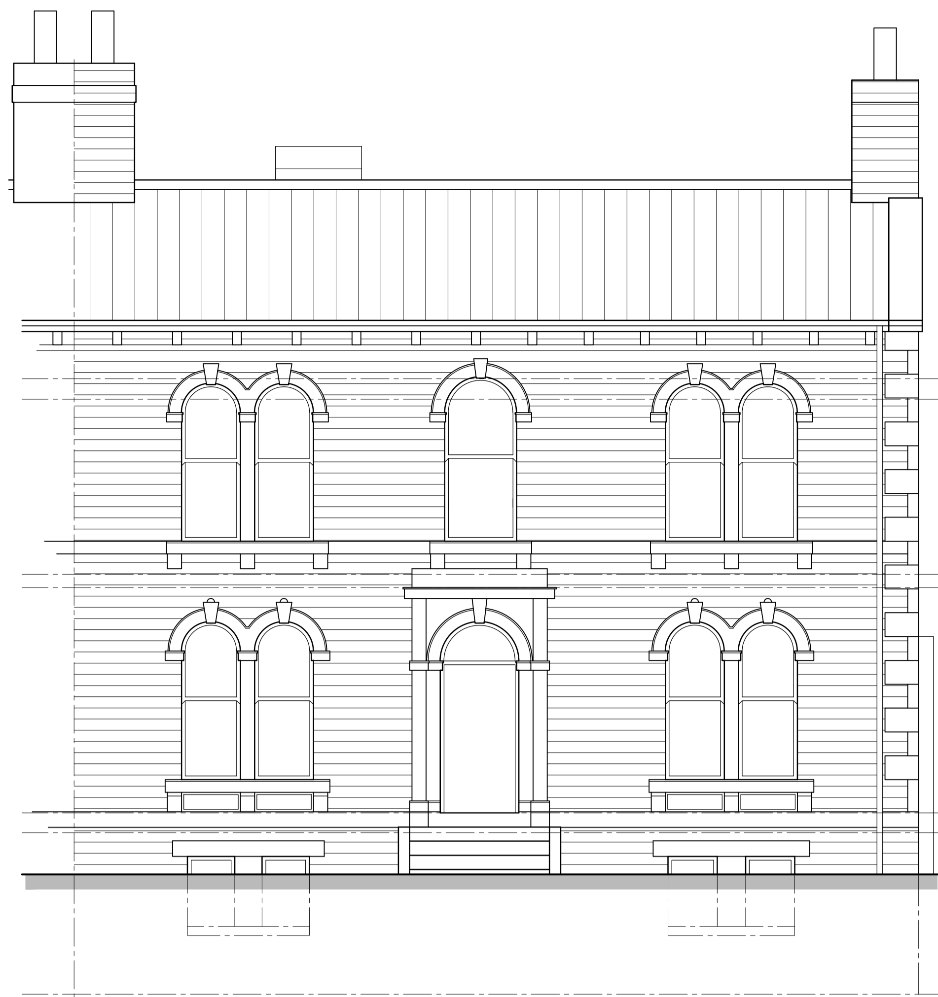
Proposed Front Elevation 1:50