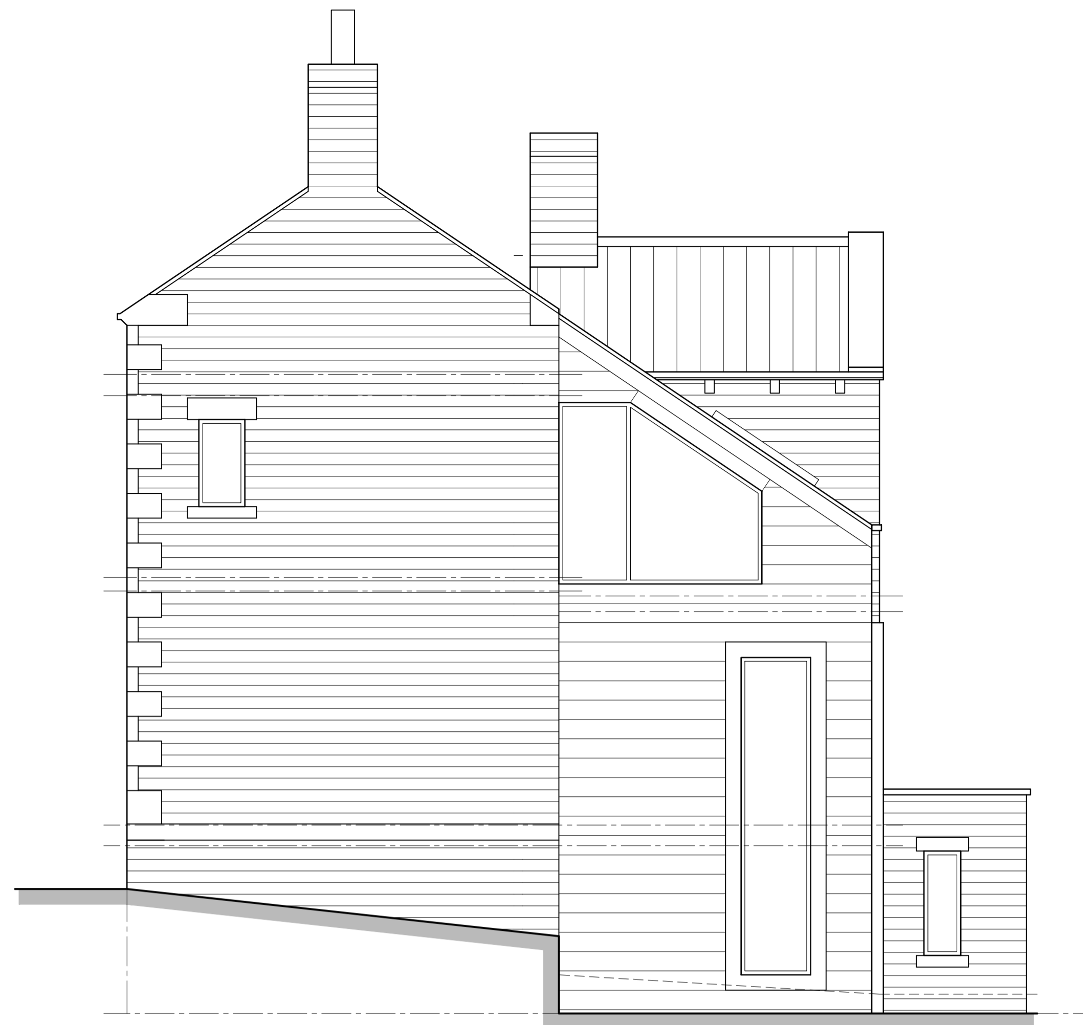
Proposed Side Elevation 1:50