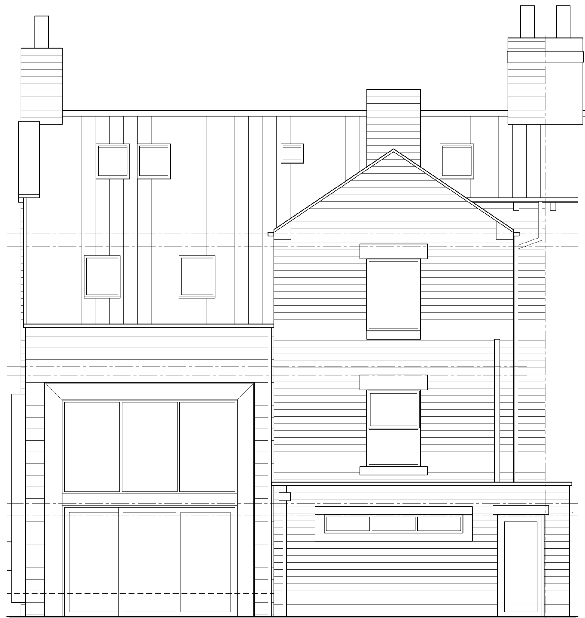
Proposed Rear Elevation 1:50