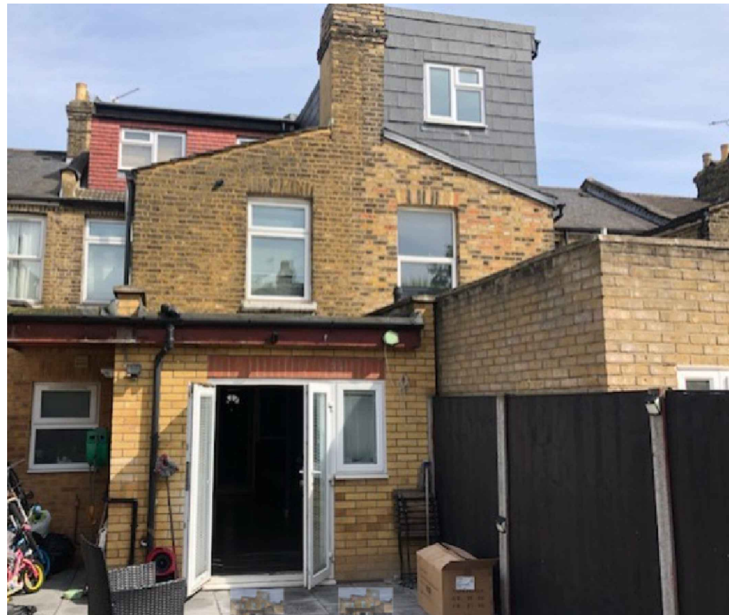
REAR VIEW OF PROPOERTY