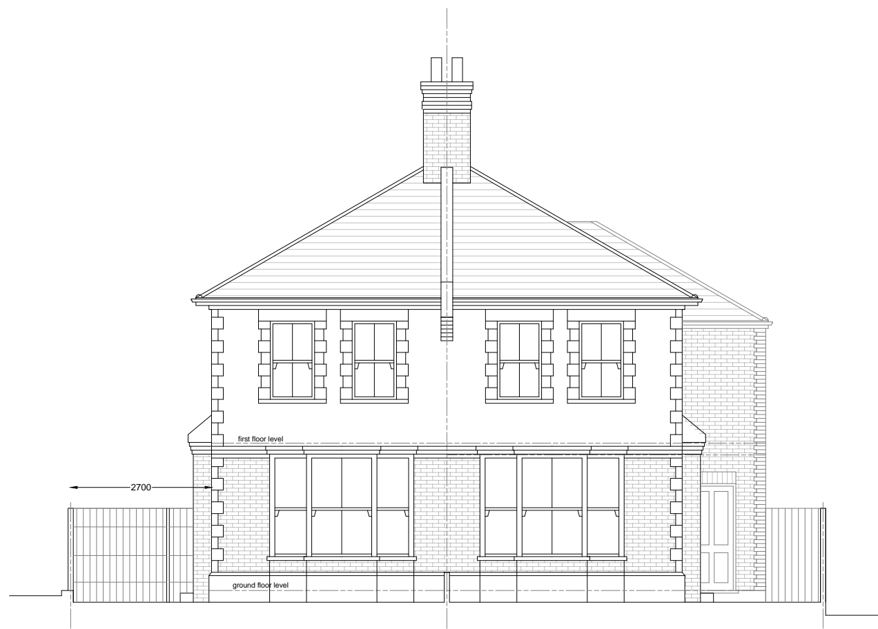
ADJOINING PROPERTY NO. 42