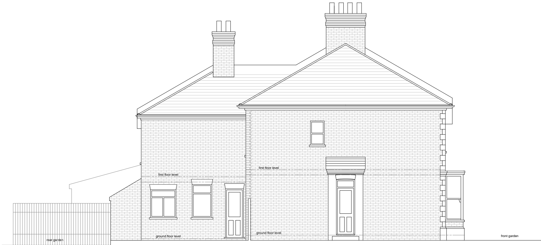
EXISTING SIDE ACCESS ELEVATION