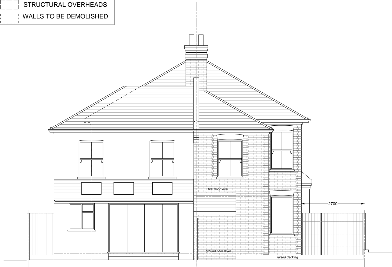
ADJOINING PROPERTY NO. 42

Any work commencing before approvals have been granted is at the risk of the Client and the builder.