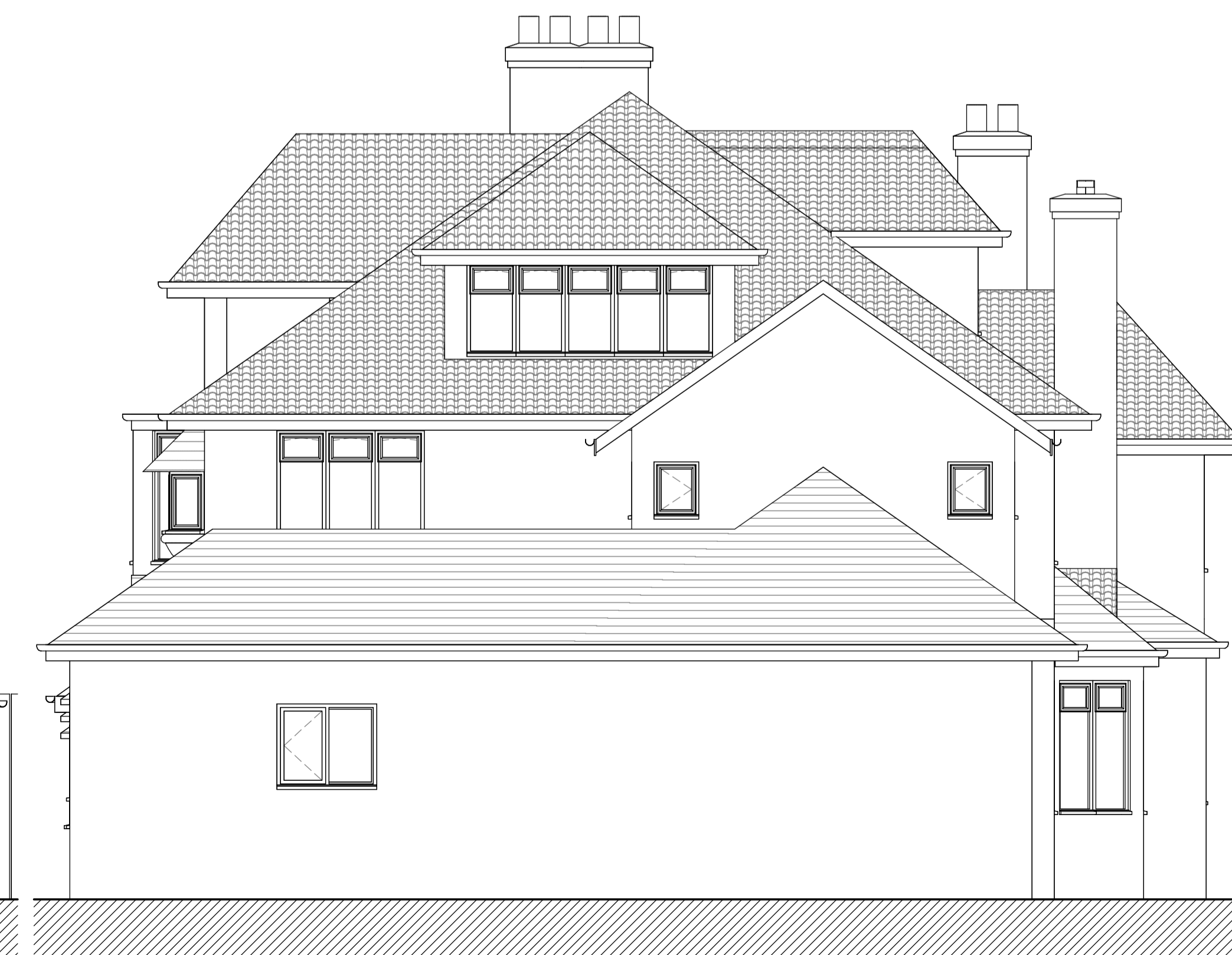
Side Elevation II 1:50